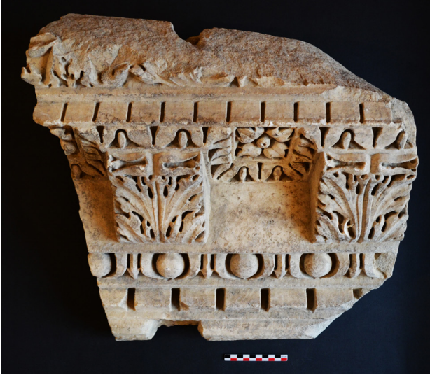
Fig. 3. Vaison-la-Romaine, Forum, cornice, white Carrara marble