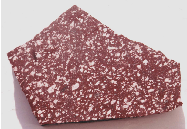
Fig. 2. Texture of Imperial Porphyry, Lykabettus quarries, Mons Porphyrites