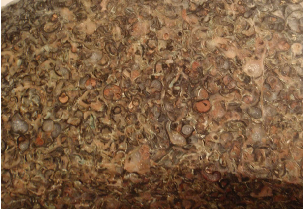
Fig. 6. Polished slab of Purbeck marble showing texture

grain size, etc., is an uncertain method and can often be wrong. Indeed, samples from the same quarry can often be morphologically different, while samples from different quarries may have similar visual characteristics. Many archaeologists have assumed that the major source of white marbles found in Roman Britain are Italian on grounds of proximity and the prodigious output of the Carrara quarries. The late 1 st century Richborough Monument, the only known building in Roman Britain to have external marble cladding (white), probably does suggest direct shipment from Italy, given the site's geographical position (STRONG 1968, 42). This view seems to be supported by spectroradiometry tests carried out at the University of Southampton, which point to a Carrara origin for the samples tested.