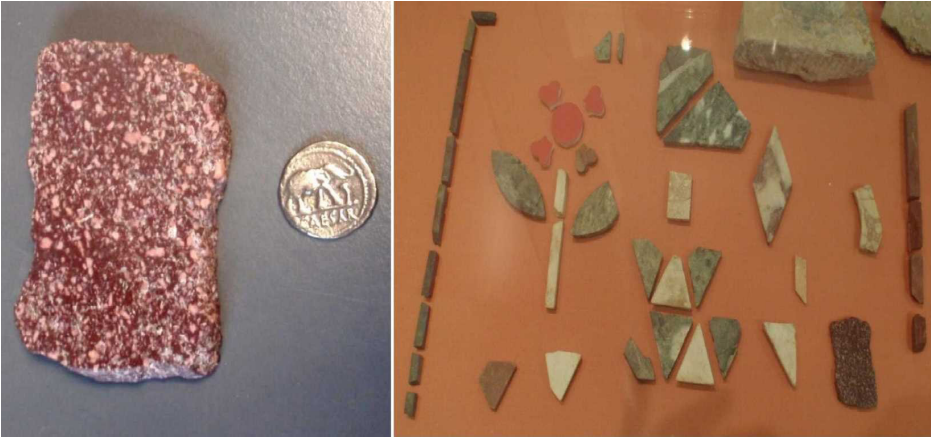
Fig. 8. Left, small piece of shaped Imperial Porphyry, on display at the Piddington Roman Villa Museum. Right, possible arrangement of an inset Pietra Dura design for a piece of furniture, on display at the Piddington Roman Villa Museum