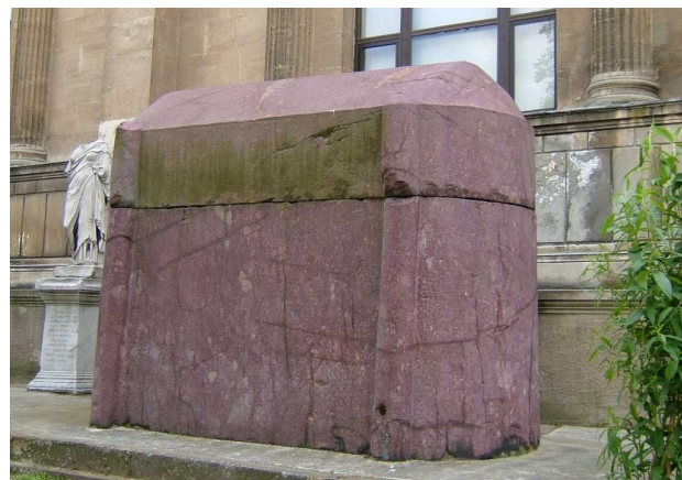
Fig. 1. Massive Imperial Porphyry sarcophagus displayed outside the Istanbul Archaeological Museum; originally housed in the Imperial church of Hagia Eirene

Imperial porphyry ( porfido rosso antico ) was greatly admired during the Roman and Byzantine periods because the deep purple of the stone was a colour worn exclusively by the Emperor himself (Fig. 1, massive rare purple porphyry blocks continuing the ideology of the exclusivity of the emperor, even in death). When Constantine was converted to Christianity in AD 324, purple was also adopted as a church colour. Imperial porphyry is an extremely hard volcanic rock, so much so that during its reuse in the 16 th century, Giorgio Vasari mentions that it could only be worked by tempering tools in goat blood (BROWN 1907, 31). An exaggeration no doubt, but nevertheless an indication of the difficulties of working the stone. The rock itself is spotted with white and pink plagioclase feldspar inclusions and has been described as a quartz-andesite (BASTIA et al. 1980, 122-123; WILLIAMS-THORPE et al. 2001, 306) or