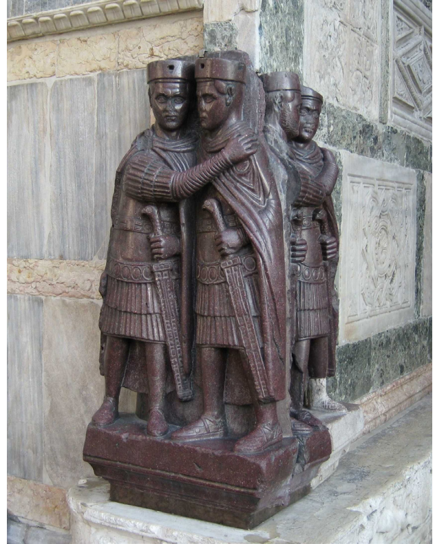
Fig. 4. Statue of the Tetrarchs in Imperial Porphyry, fixed to a corner of St. Mark's Basilica, Venice (originally from the Philadelphion, Constantinople)

Imperial porphyry was used selectively for sculpture, columns, baths, basins, sarcophagi and opus sectile , many of these items roughly finished in the quarries, and was almost always intended for Imperial use or patronage (MARMI ANTICHI 1998, 274; MALGOUYRES 2003, 27-43). Significant quantities of this stone are found in the Trajanic building projects at Rome but it became even more popular later, during the Tetrarchy and especially the Constantinian period, and its Imperial