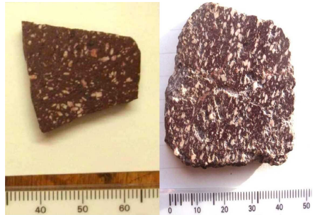
Fig. 7. Left, small piece of shaped Imperial Porphyry from Rivenhall Roman Villa. Right, small piece of damaged Imperial Porphyry from excavations at Billericay

In Roman Britain, most of the coloured marble seems to have originated from the eastern Mediterranean region (particularly Asia Minor and Greece) or from the Pyrenees (see fig. 5; PEACOCK, WILLIAMS 1999, passim ). Pritchard's (1986, fig. 4) survey of marble in Roman London identifies 21 different types found on 44 sites. This wide variety suggests that London may to some extent have been a secondary source of supply for other British sites, although differences in the pattern of distribution regarding Campan Vert from the Pyrenees may indicate other possibilities (PEACOCK, WILLIAMS 1999, 355). However, the current evidence shows that the overall sources of supply of coloured marbles to Britain were not constant and that chronological/geographical differences played a part in importation, due perhaps to difficulties of supply or changes in fashion. To supplement the relative paucity of coloured imported marbles, local materials, usually limestones that would take a fine polish ( lumachella marbles), were used to a certain extent as decorative stones. The most important of these was Purbeck marble, which was exploited soon after the Roman Conquest. This is a hard freshwater limestone from the upper part of the Jurassic and found only on the Isle of Purbeck, south-eastern