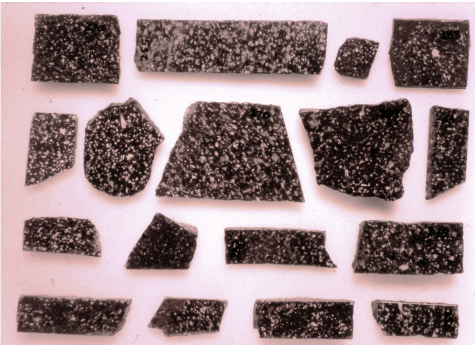
Fig. 9. Imperial Porphyry from Colchester

(FRIENDSHIP-TAYLOR, FRIENDSHIP-TAYLOR 2009, Pl. 10; see also Fig. 8, right and ISSERLIN 1998, 145). This suggestion has much to commend it, since the single pieces from Rivenhall, Billericay and Piddington are quite small and, given how expensive this stone appears in Diocletian's Price Edict (MALACRINO 2010, 30), the cost of producing a meaningful number for a pattern on wall veneer or opus sectile would have been quite high. Instead, a small amount, perhaps only one or two pieces, used in a limited way along with other "exotic" marbles inlaid for pietra dura style furniture, would create an equally impressive picture of luxury, as presumably was the case with the inlaid furniture at Fishbourne (CUNLIFFE 1971, 15-37). This view would also accommodate the notion of "Imperial gifts" to important local dignitaries. Much less likely does it seem that somehow these three pieces could have been deposited on their respective sites in the post-Roman period, when small pieces of marble, especially