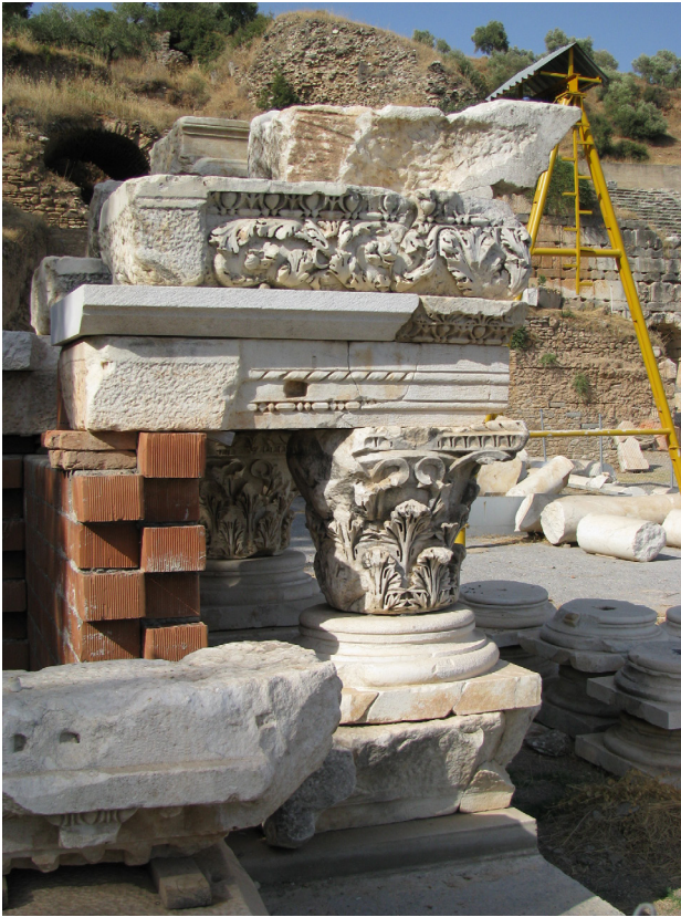
Fig. 5. The column architecture of the 1 st storey (excepting the shaft). The upper profile of the architrave is carved separately

the proskenion , the stage building and scaenae frons were built during the 2 nd century A.D. when they also underwent renewal and restoration. In his study of the theatre, Kadioğlu could distinguish two Imperial time construction phases: one during the Hadrianic period and a second phase dating in late Antonine-early Severan time (180–200 A.D.). The preserved architectural elements allow only the reliable reconstruction of this latter phase; the Hadrianic time construction activity is mainly evidenced by the stylistic features of the architectural decoration of the proskenion and few architectural elements reused in the later phase 13 .