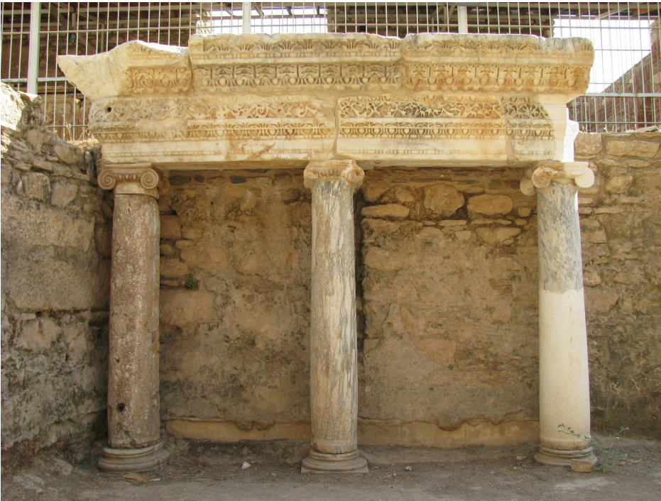
Fig. 4. The restored columnatio of the proskenion

the urban settlement had an orthogonal street system 10 . The theatre was situated at the north of the city and leaned with its cavea against the mountain slope (Fig. 2).