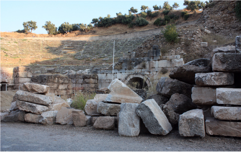
Fig. 3. Blocks from the analemma -walls