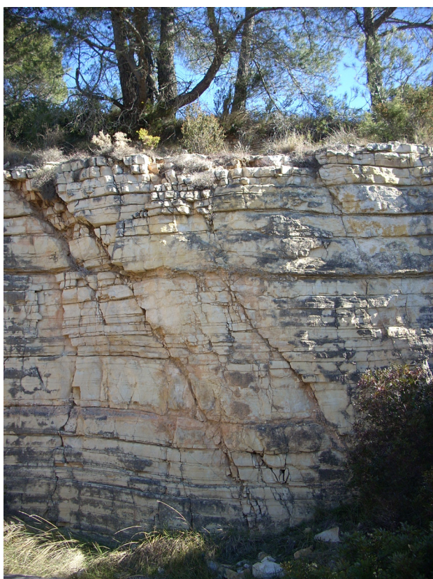
Fig. 2. Two examples of the strong bedding of Alcover stone outcrops. A: millimetric/centimetric and B: decimetric bedding

the quarries have demonstrated the Roman presence at least during the 1 st -2 nd centuries AD. 5