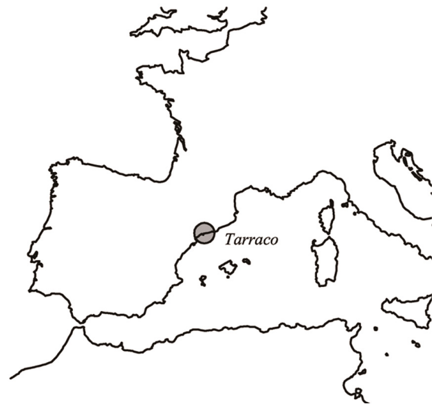
Fig. 1. Tarraco in the western Mediterranean context

Updating of the recently re-edited epigraphic corpus 1 is a key element in a multidisciplinary project aiming at understanding the stones used for the inscriptions of Tarraco (Hispania Tarraconensis). 2 After a study of Santa Tecla