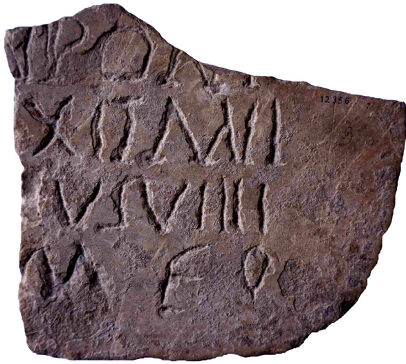
Fig. 7. Slab with an epitaph from the 4 th -5 th centuries (CIL II2/14, 1603)

parallelepiped blocks, a kind of support that previously only stones similar to El Mèdol were capable of providing. As previously noted, archaeology does not offer evidence of when the Alcover quarries were abandoned, but one can have some confidence that their stone was gradually replaced by Santa Tecla and other minor local limestones - among them the so-called “llisós”- until its total disappearance from the epigraphic record. 22