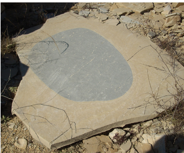
Fig. 3. Alcover stone slabs in different colours: A: beige red (due to fire) (CIL II2/14, 977), B: beige (CIL II2/14, 1270) and C: a case of combination of two tones in the same slab