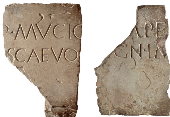
Fig. 6. Opisthographic inscription from Tarraco (CIL II2/14, 991-988)

This preference for Alcover stone in elite epigraphy contrasts clearly with the use of other local limestones, among them El Mèdol stone, which was mostly used for structural purposes. For instance, El Mèdol stone appears in funerary buildings and in parallelepiped blocks that contain private epitaphs. 17 These monuments belonged mainly to ordinary people, freeborn people, freedmen and slaves. According to the palaeography, onomastics and formulae, they date from the first century BC to the