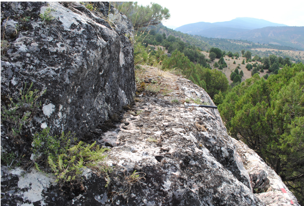
Fig. 6. Possible extraction area in Çalçak quarry (Mihalıççık, Eskişehir)

(Figs. 5-6). The Çalçak quarry material seems to be dated to the lower-middle Miocene epoch, including lacustrine limestone, marl and shale. One of inscriptions which will be discussed in this study and a few architectural elements found in the necropolis area seem to be made of limestone. 18 Unfinished cut stones support the conclusion that the stone was extracted from that quarry, shaped and finally used in a burial context. As the quarry was on the hill, it was easy to transport the stone down to the necropolis.