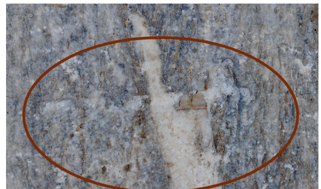
Fig. 11-12. A detail from the stela with a hammer (malleus) depicted below the inscription. Çalçak Roman necropolis (Mihaliçcik, Eskişehir)

Korinthos, was also a quarryman. These two inscriptions may indicate a stonemasonry tradition in the region.