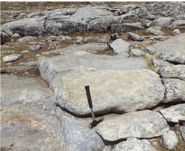
Fig. 9. Extraction traces in a marble quarry in Kayapınar, near Otluk village, (Mihaliççık, Eskişehir)

of a church and some marble blocks are still visible. The marble used in Kayapınar had presumably been extracted from the quarry in close proximity to the site.