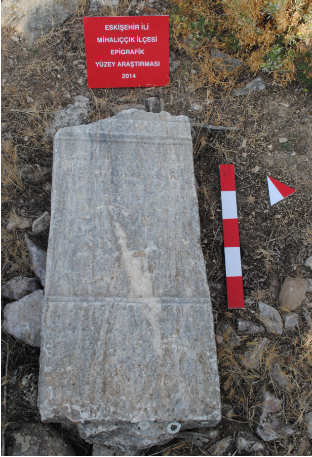
Fig. 10. Epitaph of Loukios

As there is no further analysis on epigrams from Çalçak and no further evidence, it is difficult to say whether the engraver from stonemason community or local poets composed those epigrams.