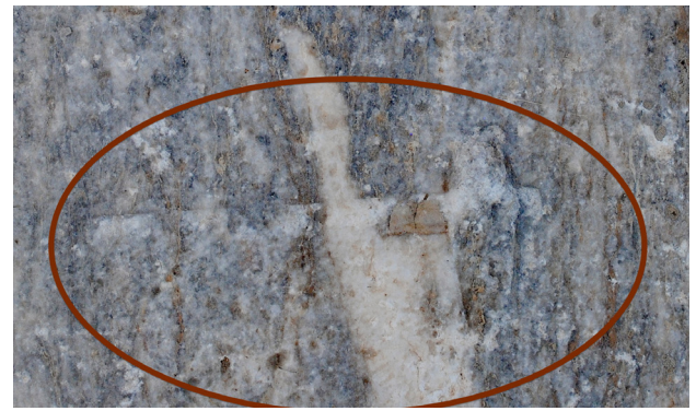
Fig. 11-12. A detail from the stele with a hammer (malleus) depicted below the inscription. Çalçak Roman necropolis (Mihaliçcik, Eskişehir)

Korinthos, was also a quarryman. These two inscriptions may indicate a stonemasonry tradition in the region.