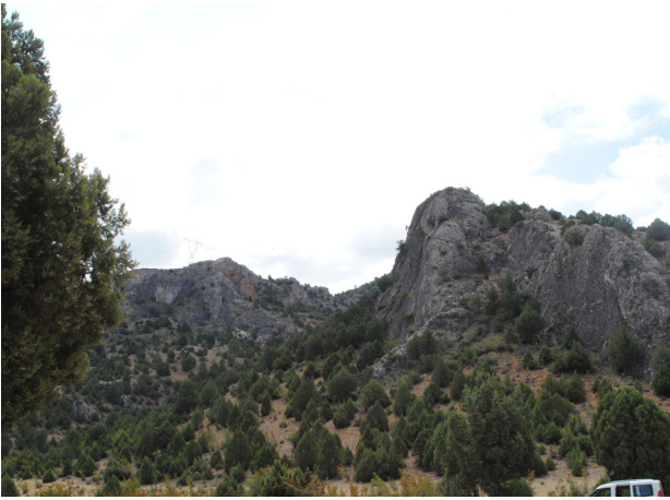
Fig. 3. The landscape at Çalçak (Mihaliççık, Eskişehir)