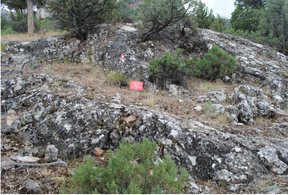
Fig. 5. Possible extraction area in Çalçak quarry (Mihalıççık, Eskişehir)