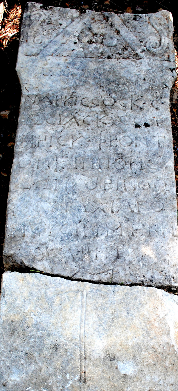
Fig. 13. Epitaph of Korinthos and Eutykhia

these monuments only make a general reference to the building and construction business. It is unclear whether the person commemorated was a marble worker, an architect, a construction manager or an engineer. 28 Among those inscriptions however there is one inscription (no. 92) which bears a very famous family name, Cossutius, although it does not mention their profession. The Cossutii were in fact a very wealthy family that appears to have been involved in building, stone supply and