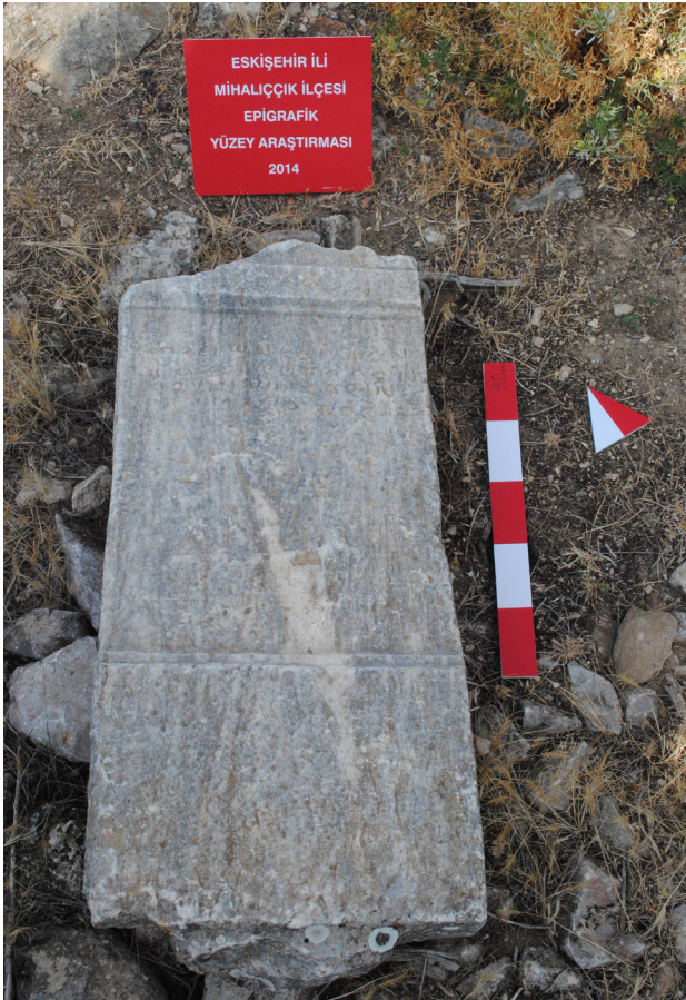
Fig. 10. Epitaph of Loukios

As there is no further analysis on epigrams from Çalçak and no further evidence, it is difficult to say whether the engraver from stonemason community or local poets composed those epigrams.