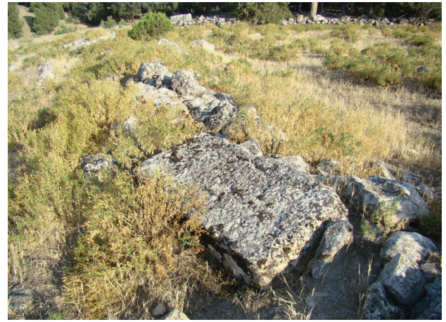
Fig. 4. Unfinished cut stone in the Çalçak Roman necropolis (Mihaliççık, Eskişehir)

The area surveyed in 2014-2015 covered almost all the villages in the Mihaliççık district including Gürleyik, Akçaören, Çalçı, Çardak, Dinek, Sorkun, Kayı, Güce, Kozlu, İkizafer, Yalım kaya, Kızıl b örüklü and Otluk and their territories (w. 1). Ten of the fifty inscriptions found in this survey came from a necropolis situated close to a limestone quarry at Çalçak, a site 4 km distant from Dinek village in Mihaliççık (Figs. 2-3). The Çalçak Roman necropolis is located south of Armutlu Farm (350 m), north-east of Dinek village (3600 m) and north-east of Gürleyik village (4230 m) and was detected during an illegal excavation and registered as Roman settlement