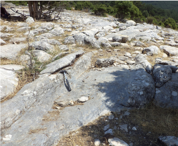
Fig. 8. Extraction traces in a marble quarry in Kayapınar, near Otluk village, (Mihaliççık, Eskişehir)