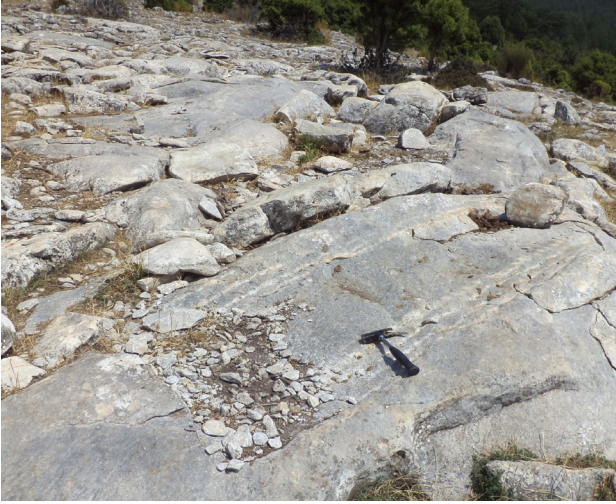
Fig. 7. Extraction traces in a marble quarry in Kayapınar, near Otluk village (Mihaliççık, Eskişehir)