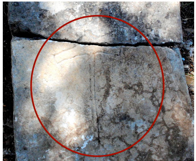
Fig. 14-15. A detail from the stela with a pick (dolabra) described below the inscription. Çalçak Roman necropolis (Mihaliççık, Eskişehir)

carving over an extended period of almost four hundred years. 29 Çalçak, on the other hand, was a traditional village