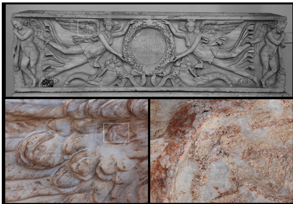
Fig. 3. The details of Victoria right wing show the original and secondary paintings that have affected the Ulpia Domnina 's sarcophagus. Here, we can also see that her flight feather is painted red, whilst the short feathers are blue like a well-known conventional 'pictorial paradigm' (MNR-TD inv. 125891)

copper, which was intentionally used as a ground layer for the gold leaf to give a different emphasis to the overlying gold (SAPELLI 2002, 194). In this respect, it is interesting that Reiner Sörries and Ulrike Lange did not consider grey-green and grey-blue as real colours but as a degraded state of silver (LANGE, SÖRRIES 1986, 14).