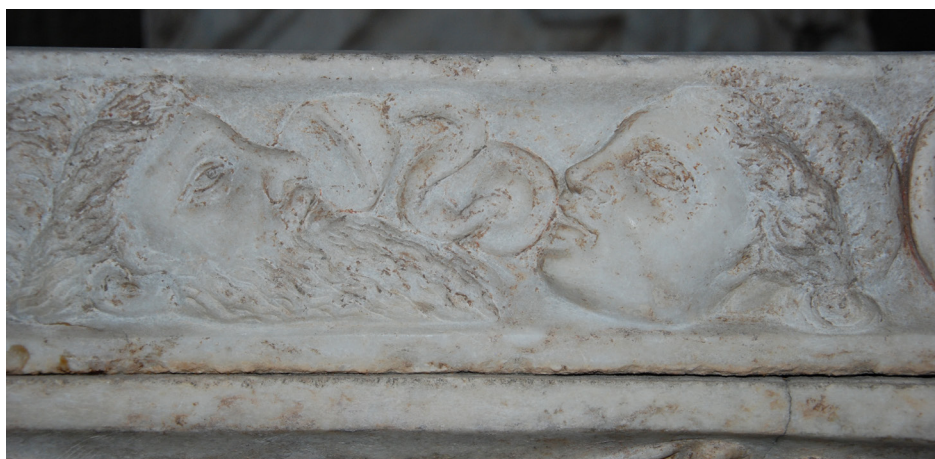
Fig. 7. Black colour was superimposed on red to highlight chiaroscuro contrast on the masks hair, shave and features face on the lid's Dionysian sarcophagus (MNR-TD inv. 124736)

used to create effects of light and shade, which in turn highlight their brilliance and contrast as well as the sense of relief depth. This is the case, for example, of a strigilated lenòs sarcophagus with portrait and groups of lion and victim (fawn) at the corners, and a large rectangular lid terminating in semi-circular antefixes (Museo Nazionale Romano – Terme di Diocleziano, inv. 124745) where red and yellow ochre have been used to create the palmettes with only the use of colour on the lid antefixes and the male lions' manes. The same use of colours to generate chiaroscuro effects is also visible in some Dionysian sarcophagi dated at the end of the 2 nd century as, for example, the so-called 'Conservatori sarcophagus' in the Musei Capitolini, inv. 1378 (PIETROGRANDE 1932). Here, the combination of red and yellow ochres is well-preserved on the lion's mane and the horse's mane and tail (Fig. 6; SIOTTO 2017, 163).