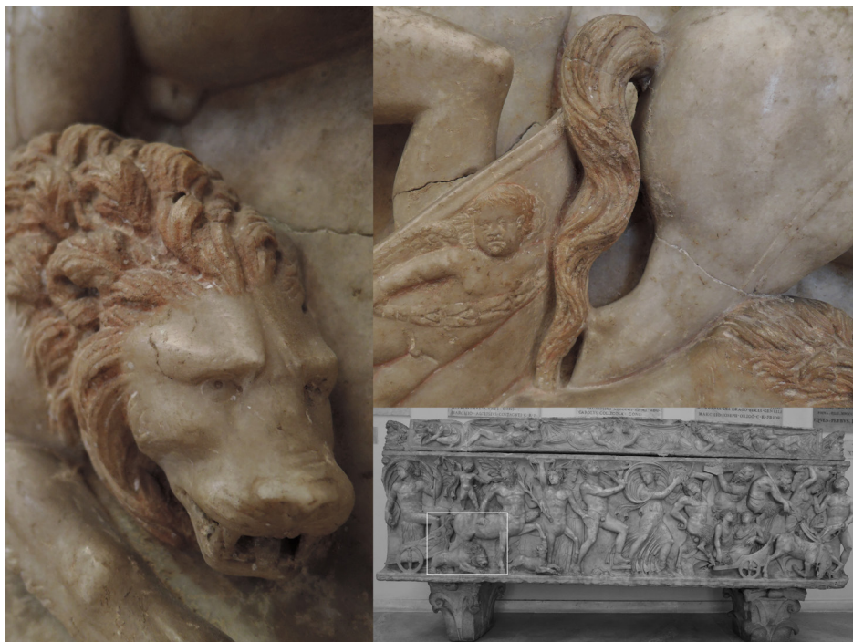
Fig. 6. Red and yellow have been used to create chiaroscuro effects on the lion mane and horse tail in the so-called 'Conservatori sarcophagus' (MC inv. 1378)