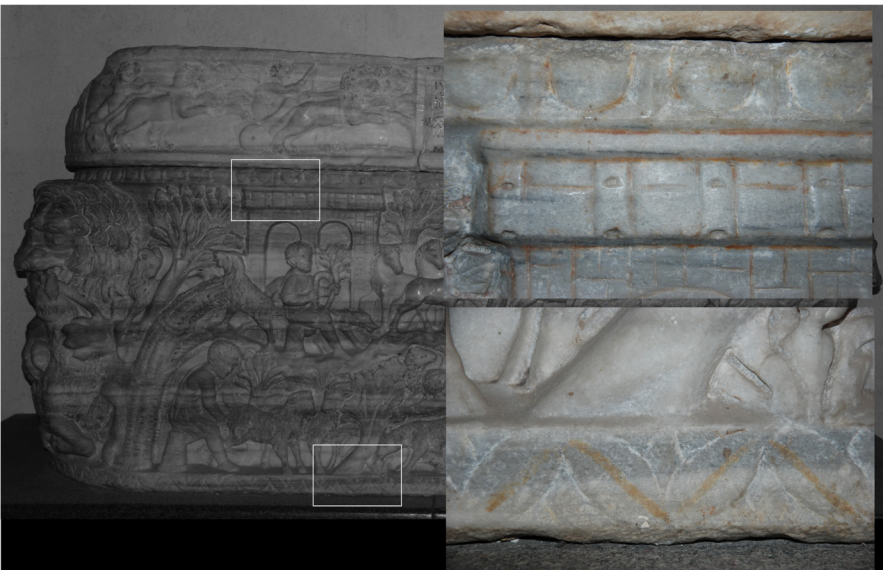
Fig. 5. Polychrome details show red colour superimposed on yellow layer to highlight the Ionic and Lesbian kymàtia , and the wood roof elements of the shepherd's hut on the bucolic sarcophagus dedicated to Iulius Achilleus (MNR-TD inv. 125802)

diluted yellow ochre have been used as a substrate for very thin lines of dense red ochre, which highlight minute details such as eyelashes and eyebrows (Fig. 4). These thin lines of dense red ochre on lines of diluted yellow ochre have also been used to paint bracelets ( armillae ) or some leather details such as saddlebags and shoelaces or, again, wooden elements (Fig. 4) such as tree bark, chariot spokes, sticks, hoes and spades (SIOTTO 2017, 159).