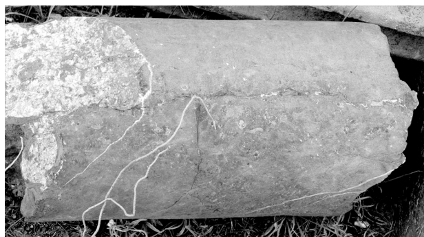
Fig. 17. Small column shaft of fossiliferous limestone, possibly from Boudjoudoune, column deposit, Thamugadi. USF10881

Filfila by its swirling cloudy markings as well as its isotopic signature, USF10880 (Fig. 15). Other important stones of NE Algeria, such as onyx marble from Mahouna and spotted and streaked marble from Cap de Garde, seem to appear rarely at Thamugadi and Lambaesis. They may have been used combined with cipollino in a pavement in