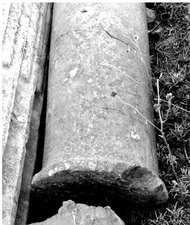
Fig. 16. Small column shaft of fossiliferous limestone, possibly from Guendou, column deposit, Thamugadi. USF10878

Filfila by its swirling cloudy markings as well as its isotopic signature, USF10880 (Fig. 15). Other important stones of NE Algeria, such as onyx marble from Mahouna and spotted and streaked marble from Cap de Garde, seem to appear rarely at Thamugadi and Lambaesis. They may have been used combined with cipollino in a pavement in