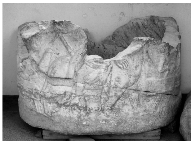
Fig. 3. Basin with Bacchic reliefs, marble from Mt. Filfila, Thamugadi Museum. USF10867

Some of Algeria's many quarries of colorful marble and travertine have also been analyzed isotopically, 10 but comparable data for colored marble quarries on the north shores of the Mediterranean are scanty. As a result, macroscopic identifications are important in this realm as well.