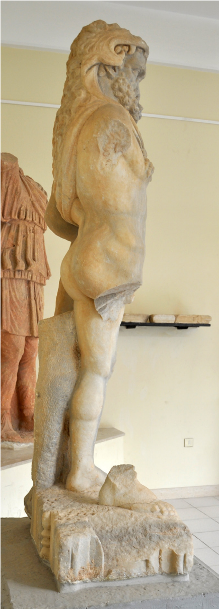
Fig. 8. Lepcis Magna, Museum – Statue of Hercules, with the remains of the reused architrave, Proconnesian marble, from the so-called Nymphaeum of Hercules

clearly show along their lower edge and on their back the remains of the decoration of the original architrave. 21