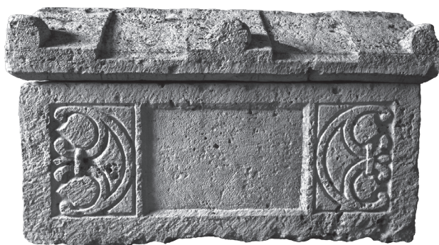
Fig. 1. Child sarcophagus from Sisak, AMZ (Lupa 573)

Croatia (Djurić et al. , in this volume). In view of this fact, the present paper addresses two travertine monuments that have already been characterised (a child's sarcophagus from Siscia / the modern town of Sisak in north-west Croatia, and a stela from the ager of Mursa ), while the core of the discussion rests with the remaining four, not yet analysed, pieces (an ash chest and three stelae, all from Sisak). They will be discussed as cases in point to illustrate and preliminarily verify the importance of the characterisation of monuments made of stone other than marble.