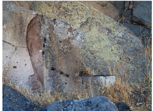
Fig. 5. Wedge-holes on a vertical rock surface before splitting in the south-eastern quarry in Larisa West

Generally, two types of splitting holes in terms of quarrying method can be identified on surfaces; narrow strip-like holes and wider-and-regularly carved holes. The narrow ones can be presented in two groups considering the length. In several cases, one single line about 20-30 cm long (or longer), 1-2 cm wide and about 3 cm deep is seen on the surface. These openings obviously served for the splitting of smaller or middle size blocks from the rock. Some of them can be considered a preliminary stage for the opening of smaller holes on the surface. On the other hand, there are hundreds of cases on site where a row of smaller rectangular holes is set into the surface of the rock to enable the splitting. These wedge holes are about 8-12 cm long, 1-2 cm wide and 3-5 cm deep (Fig. 5).