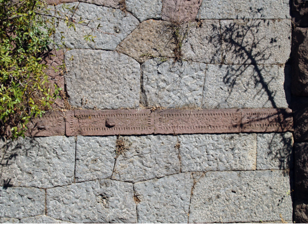
Fig. 8. Coursed polygonal masonry and horizontal decorative band at Tower I on the acropolis