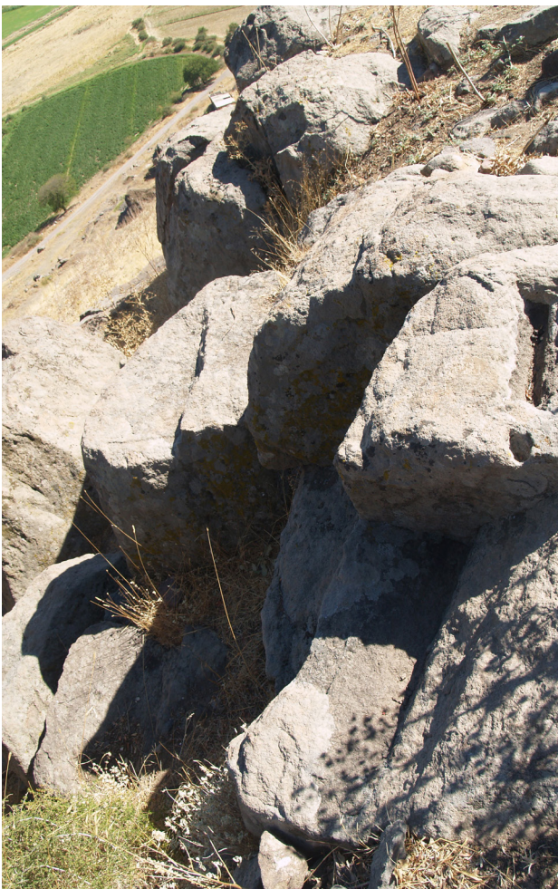
Fig. 2. Main ancient quarry area on the south-eastern slopes of the acropolis in Larisa West

contemporary times, that is in the 1970s (or earlier), and these activities unfortunately damaged the ancient traces. The larger quarry, which presents a lot of ancient traces on - the southeast of the hill where the extensive urban area is located, is one of the main quarry areas (Fig. 2). There are also remnants of recent quarrying activities on the north (Fig. 3); but were abandoned forty years ago. Above these northern quarries, on higher levels, there are traces of ancient working still to be identified. There might also be quarries opened in ancient periods on other hillsides, and these areas will be examined in detail in the next surveys. On the site of Larisa East, larger or smaller clusters of natural rock were simply used as quarries for the construction of the fort and dwellings on the terraces. Almost all smaller solid rocks on the surface were used for that purpose. These spots in and around the settlements were obviously considered the most convenient for transportation.