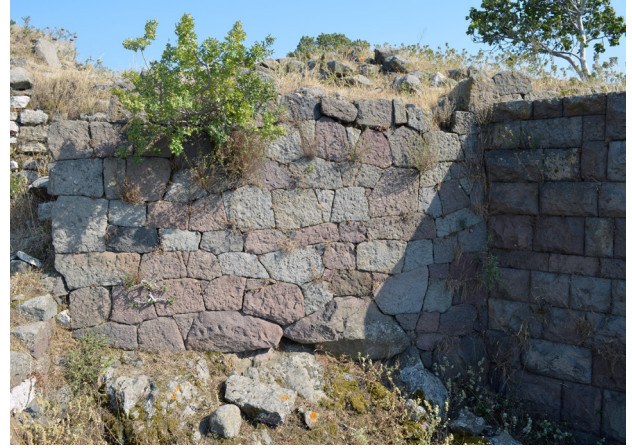
Fig. 9. Coursed polygonal masonry that includes multicolored andesite blocks near tower VII on the acropolis

with the use of four-five edged reddish-brown and bluish-grey andesite blocks together.