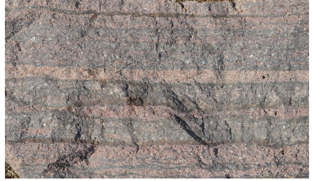
Fig. 4. Diverse color layers in the same quarry in Larisa West