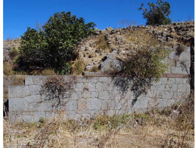
Fig. 7. Tower I of the late archaic circuit on the acropolis

Tower I on the western slope and bulwark are the sectors of late archaic circuit where construction data can be obtained and most striking examples of usage of different colored andesite can be found. The outer wall construction of the bulwark shows close similarities with