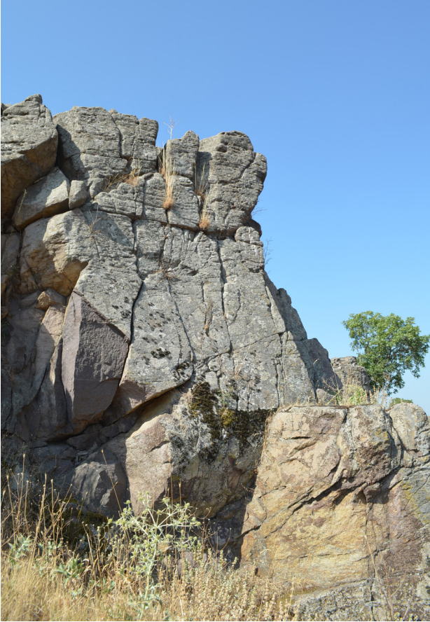
Fig. 3. Main ancient quarry area on the northern slopes of the acropolis in Larisa West

color in accordance with their concentrations. 3 While magnesium darkens the color of the stone, making it blacker, iron gives it a red color. Iron minerals give different colors in the same way. Magnetite mineral gives a dark or blackish color; hematite gives red, and limonite imparts a yellowish color. 4 Sometimes, the colors of andesite rocks may diversify with the co-existence of these minerals.