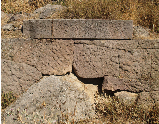
Fig. 6. The outer wall construction of the bulwark

bulwark. 5 The late archaic circuit of the acropolis displays one of the remarkable practices of polygonal masonry works in Greek defense architecture. “Lesbian masonry”, which consists of polygonal blocks with curvilinear edges, can be observed in the rising parts of the walls. The bases of the defense walls rest on bedrock and their front façades are composed of roughly carved large blocks with no special surface treatment. On the base, a double-shelled reddish-brown wall of andesite blocks with chiseled surface is constructed. Occasionally the walls rise over the blocks, which protrude from the curtain wall slightly. These blocks act like a euthynteria as in temple architecture that provides a toichobat for the rising parts of the defense wall. 6