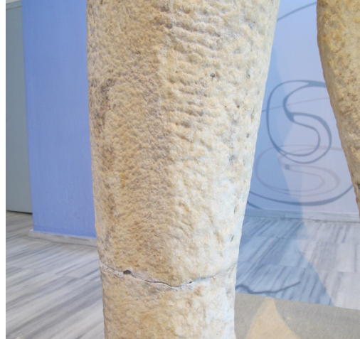
Fig. 9. Right leg, edge formed by two sides of the block cut down