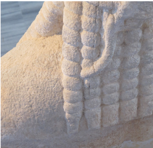
Fig. 13. Hair on the left shoulder, pricking