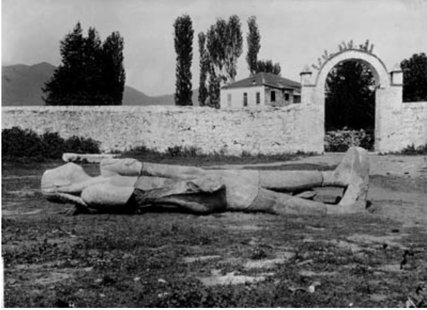
Fig. 2. Kouros reconstituted in the courtyard of the museum

Radiating from the crown of the head, the hair is arranging in long pearl locks, except on the forehead where the pearls are not yet carved. The hair is retained by a headband tied in the back and falls down on the back and on each side of the face in four parotid locks.