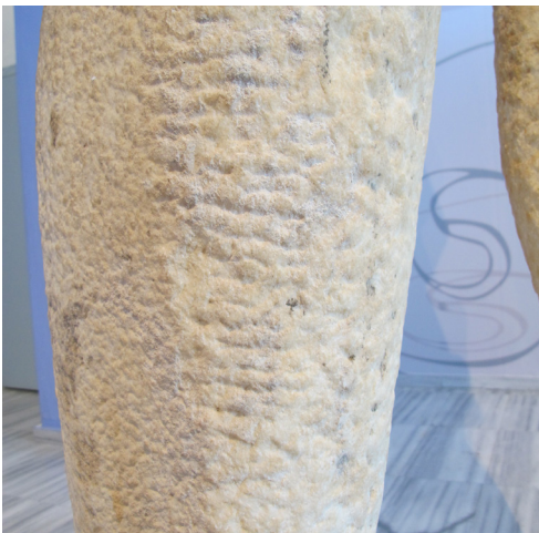
Fig. 8. Right leg, deep and long grooves ended by impacts