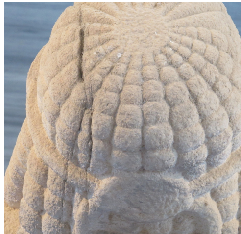
Fig. 16. Top of the head, crack on the left