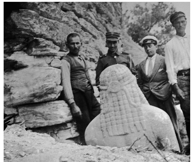
Fig. 1. Part of the kouros, after the extraction from the east wall of the Acropolis

Discovered and partially removed in 1914 by Charles Picard 2 in a medieval part of the surrounding east wall of the Acropolis, the colossal unfinished kouros from Thasos was entirely extracted in 1920 (Fig. 1). Broken in five parts – head and shoulders, torso with beginning of the legs, each leg and the feet adhering to