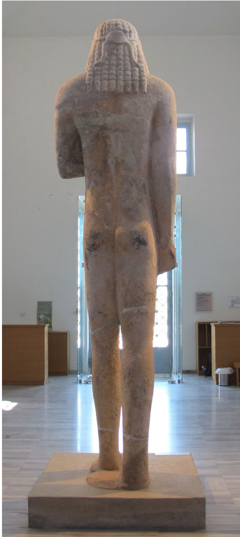
Fig. 4. Kouros, back view, Thasos 1