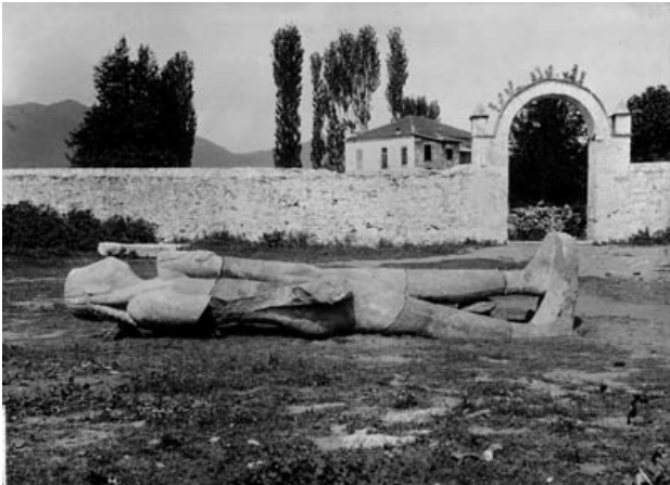
Fig. 2. Kouros reconstituted in the courtyard of the museum

Radiating from the crown of the head, the hair is arranging in long pearl locks, except on the forehead where the pearls are not yet carved. The hair is retained by a headband tied in the back and falls down on the back and on each side of the face in four parotid locks.