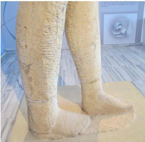
Fig. 7. Side profile of the right foot, thickness of material