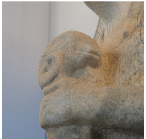
Fig. 11. Ram's head, very short grooves, close to pricking