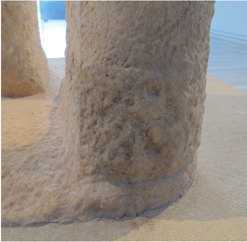
Fig. 6. Right ankle, coarse marks