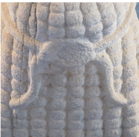
Fig. 14. Hair locks and headband bow, back view, pricking