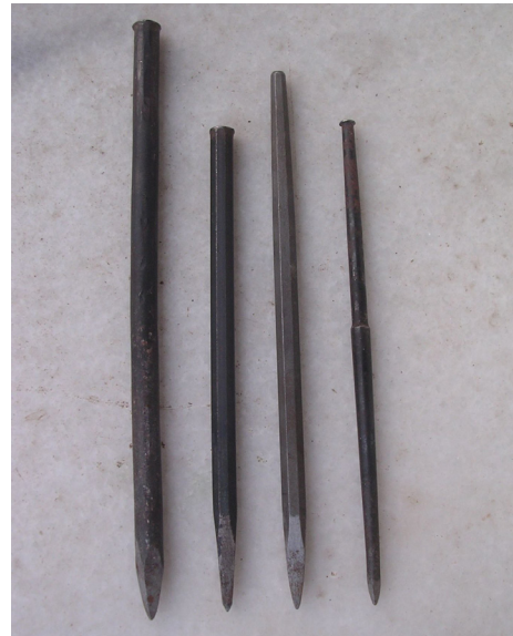
Fig. 5. Points with different sizes

the right: the work is more advanced (Fig. 12). We can also see that by observing the point marks.