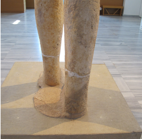
Fig. 12. Left leg thinner than the right one: more advanced work