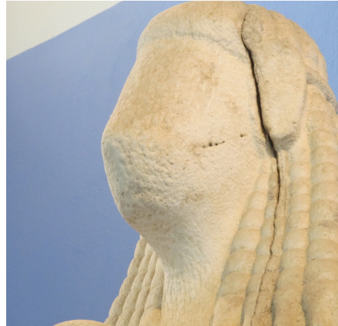
Fig. 15. Left part of the head, big crack