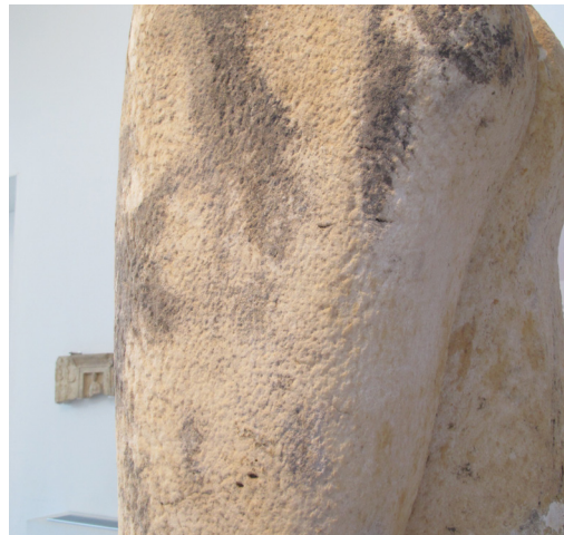
Fig. 10. Left thigh, short grooves ended by impacts