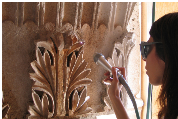
Fig. 6. Peristyle, east colonnade, pilaster capital, laser cleaning

The dark crust on the stone, up to one centimetre thick, generally consisted of gypsum, soot and iron oxides, with occasional calcium oxalate dihydrate (weddelite) particles. The greyish patina was identified as weddellite and, at places, gypsum. The yellowish patina found beneath the black crust consists of calcium oxalate monohydrate (whewellite) and dihydrate (weddellite). In addition to mineral patinas, algae and lichen covered large surfaces of stone. They were removed by washing and applying biocidal products based on quaternary ammonium salts, which proved to be effective in preventing the renewed growth of lichen. 11