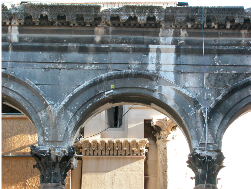
Fig. 7. Peristyle, east colonnade, detail before restoration