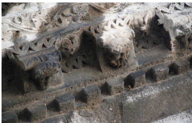
Fig. 9. Peristyle, cornice of the Prothyron gable, detail before restoration