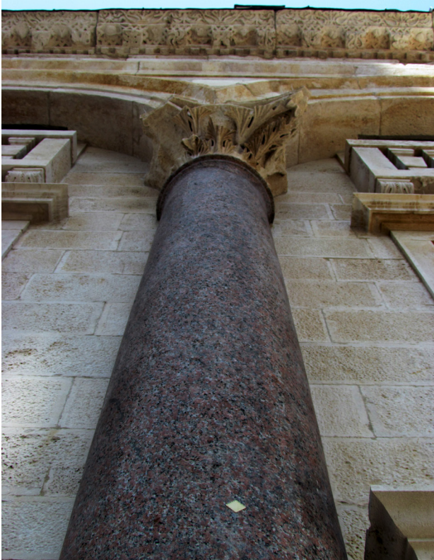
Fig. 2. Peristyle, west colonnade, a red granite column