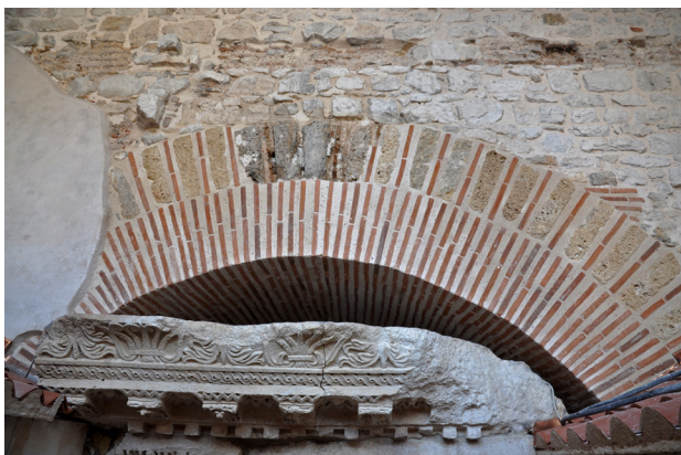
Fig. 5. Peristyle, relieving arch above the portal leading into the Vestibule after restoration

blocks on the outer side of the same façade were replaced or patched with stone or artificial stone. The wall was grouted to reduce the load concentrated on the exterior edges of ashlar which had originally been carved with slanted sides and installed without joints.