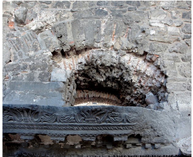
Fig. 4. Peristyle, relieving arch above the portal leading into the Vestibule before restoration

During the recent restoration works at the Peristyle, for the first time, the structure was analyzed as a whole and the problem of structural stability was fully addressed. The leading principle of the structural strengthening consisted in recovering stability and preventing further deformation using minimum and non-invasive interventions. Monitoring of stress and strain was conducted before, during and after the treatment in critical locations in order to determine deformation growth – its intensity and speed. Stress measurement of the copper clamps on the Prothyron pediment has shown that the hundred-year-old intervention is still effective.