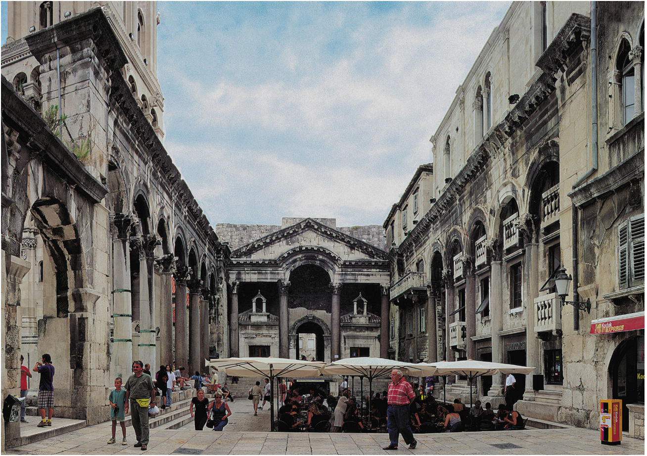
Fig. 1. View of the Peristyle before restoration

The link between the longitudinal free-standing arcaded colonnades and the transversal porch of the Protyron – the entrance to the imperial quarters – at the south end of the square was not resolved very successfully, either at the conceptual level or in the execution, with the blank wall at the end of the colonnades, and the corners of the Protyron pediment “eaten away”. The Protyron was presumably first conceived as a classical porch, free on three sides, and then transformed into a scenographic decoration squeezed between two massive walls. Evidence of that situation was found already by Niemann who pointed out the difference between the mouldings of the trabeations of the Protyron pediment and of the lateral colonnades. 6 The ends of the pediment are covered by the walls at the south end of the colonnades which were obviously added in a later variant of the design, putting out of context the piece of the trabeation still visible on top of the wall on the east side of the Protyron.