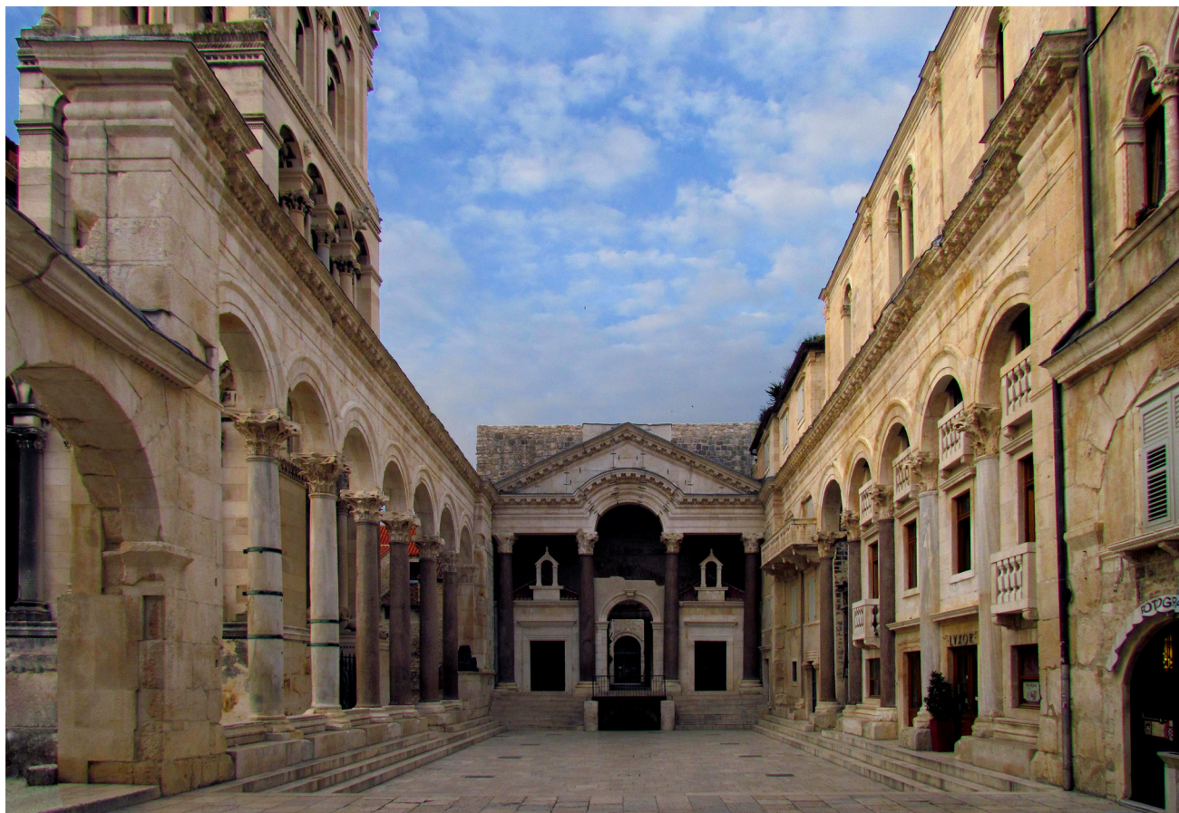
Fig. 11. Peristyle, general view after restoration

It consists of two steps. The first step involves treating the gypsum on the stone with an ammonium carbonate solution, which transforms the gypsum into a soluble ammonium sulphate. In the second step, barium hydroxide is used to transform the remaining gypsum and ammonium sulphate from the preceding step into stable barium sulphate. 13