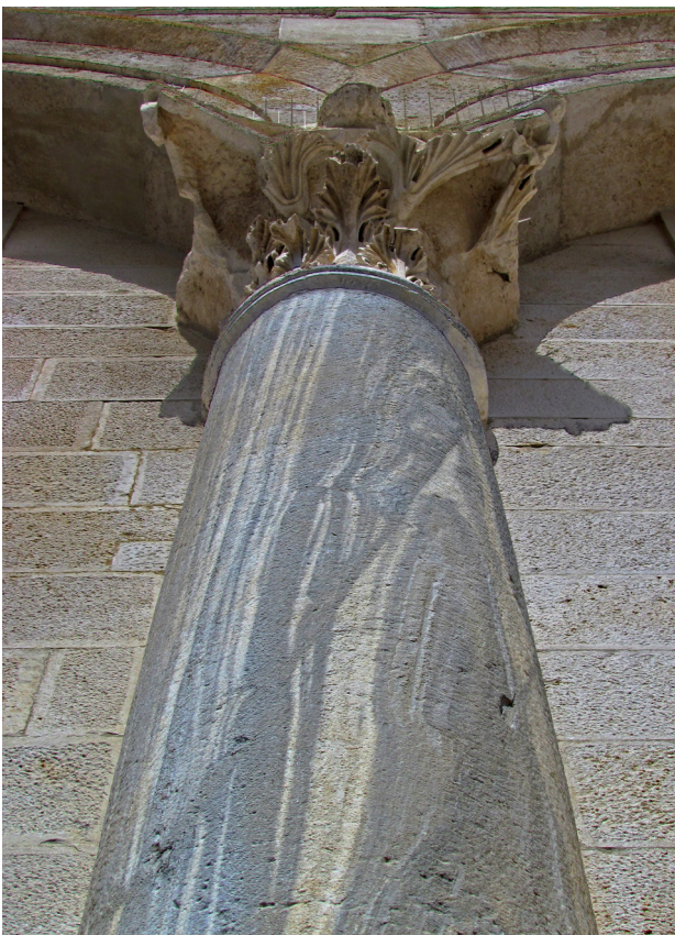
Fig. 3. Peristyle, west colonnade, a Proconnesian marble column. Toolmarks are still visible

on the east side were reused from an earlier, probably Egyptian building, and carry incisions made with a sharp object. 9 Facing them are two columns of Proconnesian marble which seem to be commissioned specially for the Peristyle and have never received a final polish. (Fig. 3)