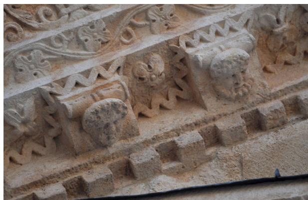
Fig. 10. Peristyle, cornice of the Prothyron gable, detail after restoration