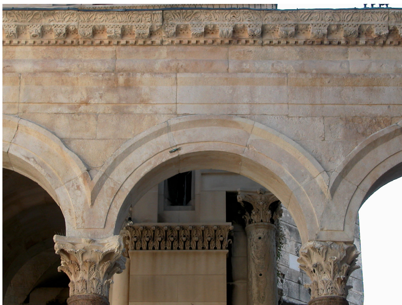
Fig. 8. Peristyle, east colonnade, detail after restoration