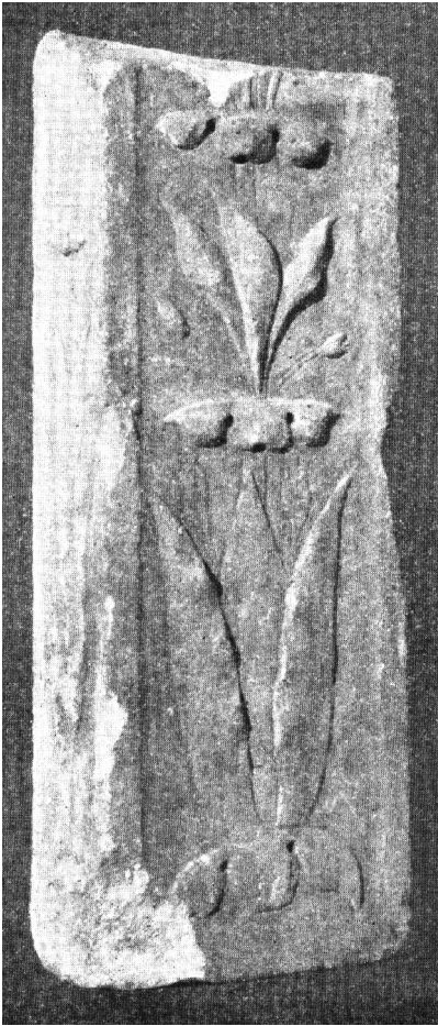
Fig. 3. Pilaster made of white marble, from room XIII

when “giallo africano” and “pavonazzetto” were mentioned for the first time as types of marble found in the thermae , the descriptions of the marble material that Gnirs left us were limited to its colour and sometimes dimensions.