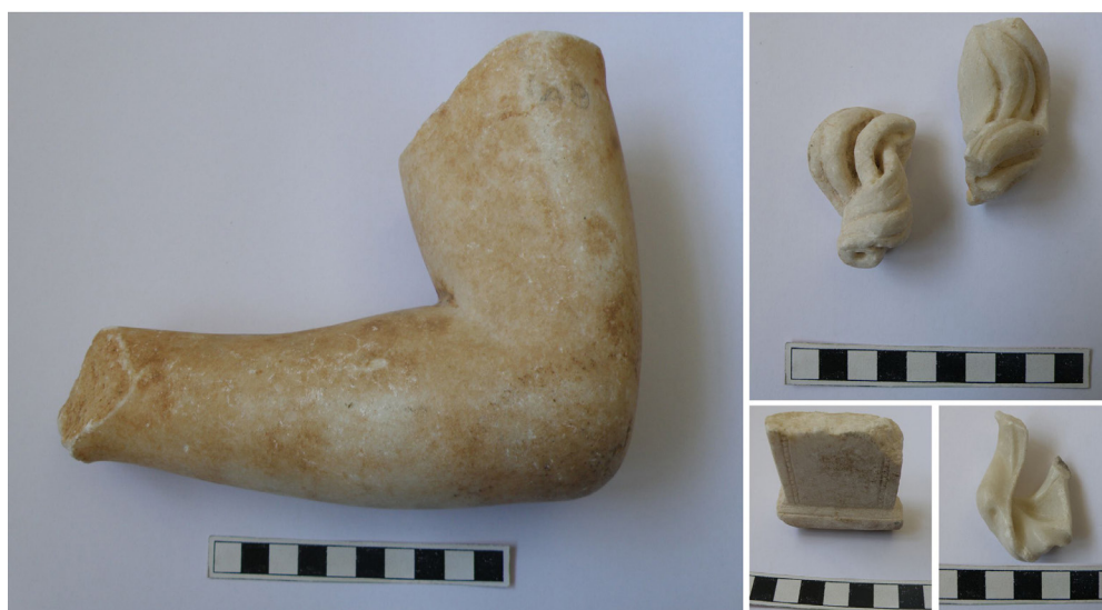
Fig. 5. Part of an arm, parts of curls and a small aedicula with holes for mounting. White marble

overlap like scales, with a triangular space between the leaves filled with three berries on one of the fragments. He also found a twisted marble pillar with an elliptical cross-section, which was decorated with leaves on its much damaged lower part. 18