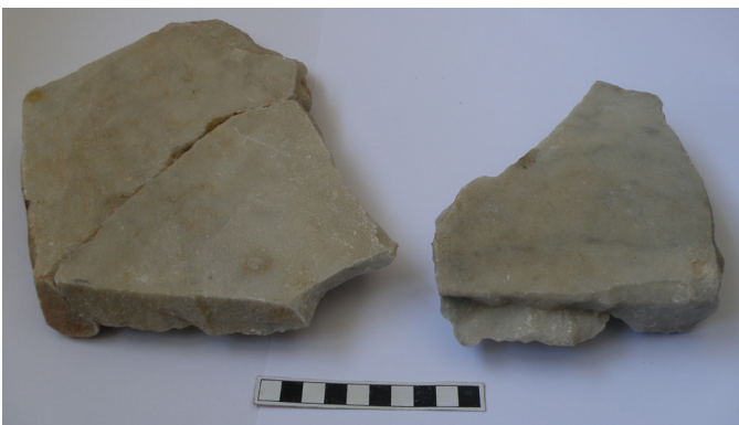
Fig. 12. Two parts of a thick hexagonal floor slab