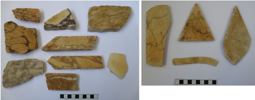
Fig. 7. Fragments of giallo antico, probably wall and/or floor decoration