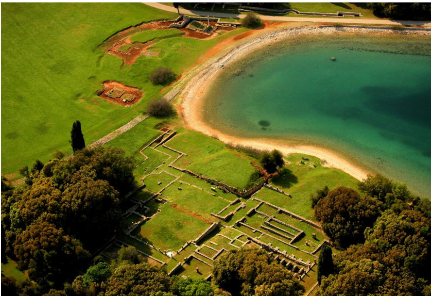
Fig. 2. Aerial view of the three-terrace villa and the temple area

a big chain that stretched between the two opposite shorelines, after which the bay itself was named (a chain is called verige in Croatian).