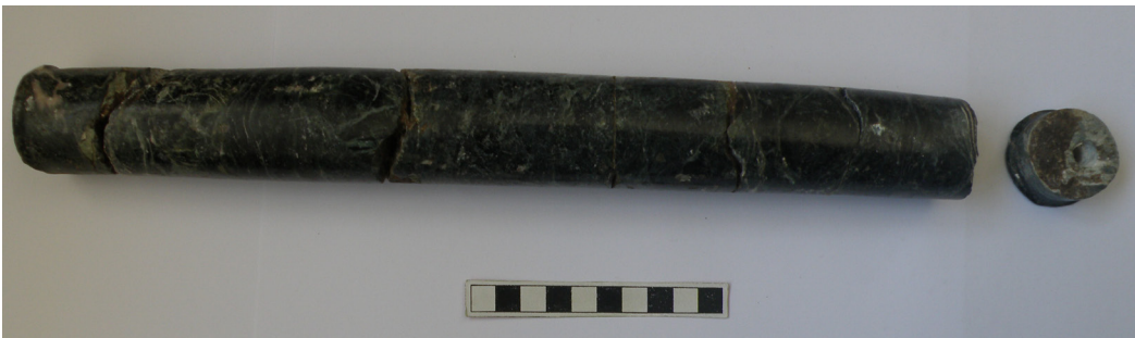
Fig. 11. Small column of africano marble; a twin is stored at the Archaeological Museum of Istria in Pula