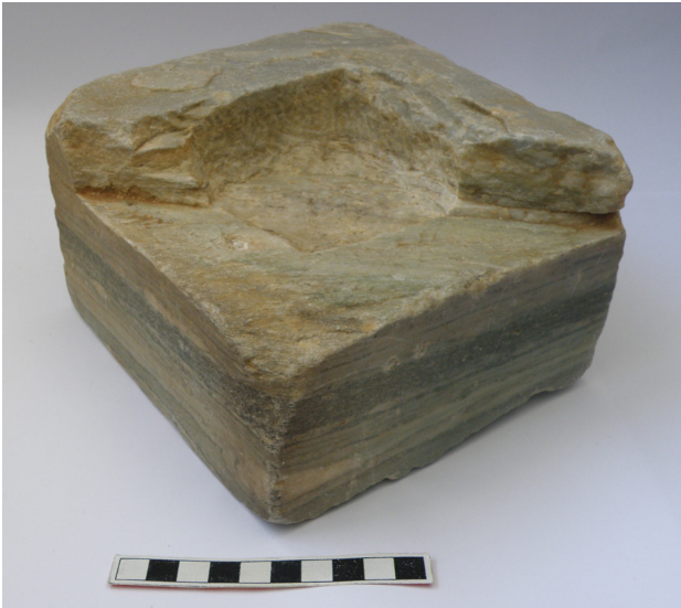
Fig. 9. Cube made of cipollino verde