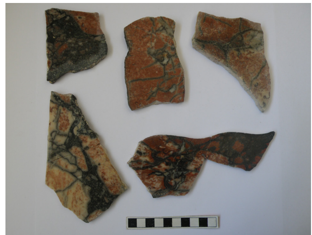
Fig. 15. Thin slabs of elaborate design, marmo africano

Today the decorative marbles that remain of the villa complex are smaller architectural decorations like a cube (maybe a base) of cipollino verde (Fig. 9), a moulded block of white marble and moulded cornices (Fig. 10). A small column of Africano marble (Fig. 11) is a very nice example of the richness of the decorations. Two fragments of Proconnesian marble (Fig. 12) which were originally of hexagonal shape, with the side length