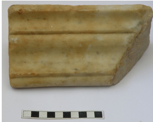
Fig. 10. Molded block and plinth in fine grained white marble