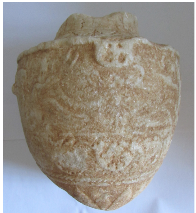
Fig. 6. Hydria, part of a sculpture, in white marble, from the temple area

The most significant fragments of marble sculptures that Gnirs found (Fig. 5) were located in the area of the temples in Verige Bay. These were small fragments, such as the thumb of a female hand, folds of clothes and curls of hair (Fig. 5). However the most important object discovered was part of a hydria (Fig. 6), a vessel with three handles for the transportation of water. It was found in 1907. 19 It was richly decorated with palmettes and antithetically placed flying swans made of white fine-grained marble. These finds helped him to recognize a Roman copy of the famous Praxiteles statue of Aphrodite from the island of Cnidus. 20