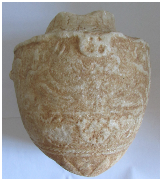
Fig. 6. Hydria, part of a sculpture, in white marble, from the temple area

The most significant fragments of marble sculptures that Gnirs found (Fig. 5) were located in the area of the temples in Verige Bay. These were small fragments, such as the thumb of a female hand, folds of clothes and curls of hair (Fig. 5). However the most important object discovered was part of a hydria (Fig. 6), a vessel with three handles for the transportation of water. It was found in 1907. 19 It was richly decorated with palmettes and antithetically placed flying swans made of white fine-grained marble. These finds helped him to recognize a Roman copy of the famous Praxiteles statue of Aphrodite from the island of Cnidus. 20