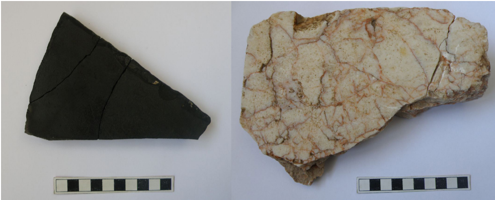
Fig. 4. Black limestone slab, and breccia corallina slab