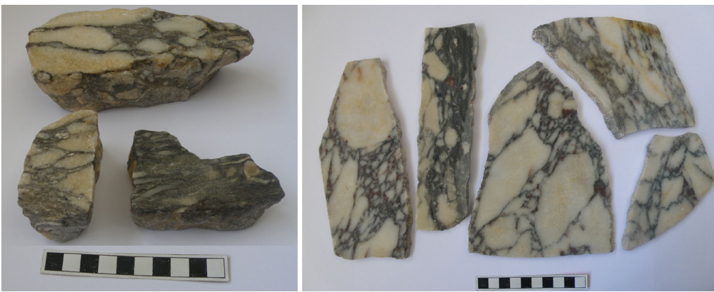
Fig. 8. Thick and thin fragments of pavonazzetto marble

In the nearby so called “Priest’s apartments” Gnirs noted “numerous marble slabs of different types and colours indicate that the walls had incrustations.” 21