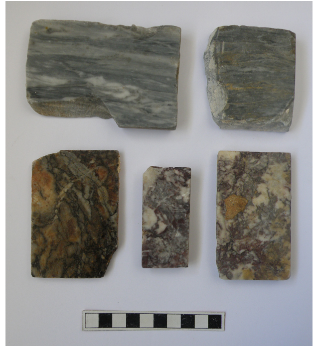
Fig. 14. Rectangular marble slabs, probably floor slabs

In the villa complex there are two balnea , but the existence of a separate thermal complex is rare in the villas of the X Regio 27 , and this further confirms the luxurious fitting out of the villa.