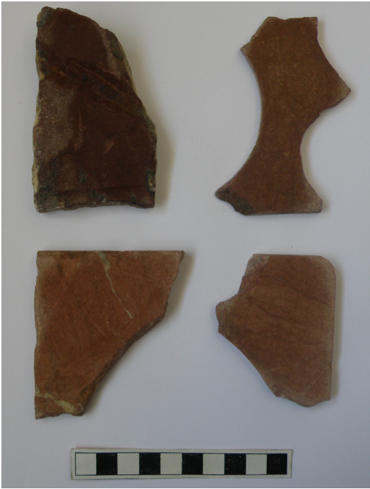
Fig. 13. Floor slabs of rosso antico marble