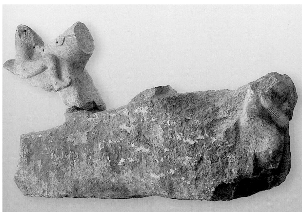
Fig. 3. Horseman, with naked woman nursing a child, from Nesactium (from MIHOVILIĆ 2013, 332-333)

but decoration is generally absent, as the tomb itself was covered with a heap of small rough stones.