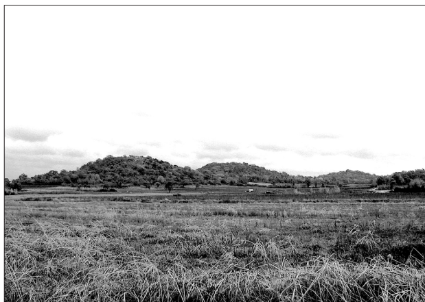
Fig. 2. The three Picugi hilltops, from the west