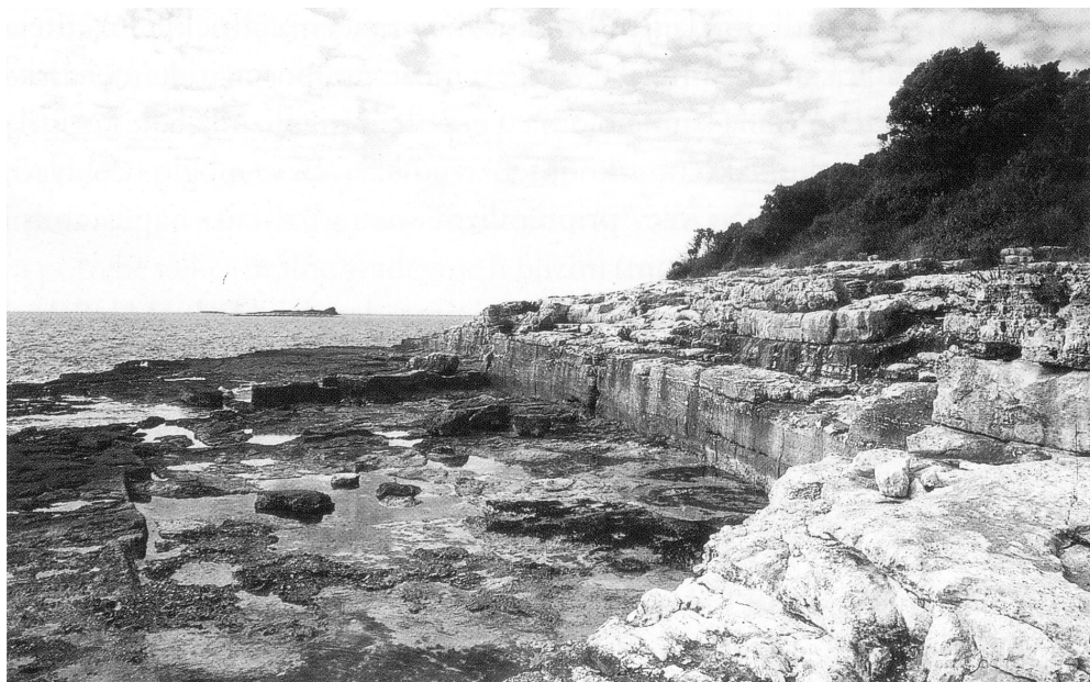
Fig. 6. Remains of an ancient quarry in San Polo Bay near Rovinj (MATIJAŠIĆ 1998, 397)

that it was used in Roman times. It is believed that the Pula Amphitheatre was built of stone blocks from this quarry. 15 Of course, most other ancient buildings in Pula were built with this stone. 16 The effort needed to transport the blocks to the sea was compensated by the exceptional quality of the stone. The site was used in the Middle Ages and in modern times until recently, and it certainly was one of the most important Istrian quarries (Fig. 6). High on the face of the cut there are traces of ancient exploitation, but it is since been excavated down to the level of the base of the hill.