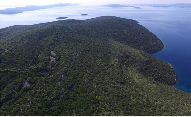
Fig. 6. Aerial view: the beginning of Donje Padrare extraction zone