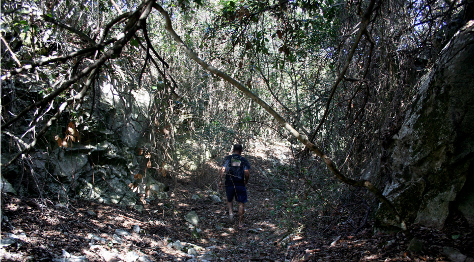
Fig. 2. Exit corridor at the Bonaster site extending towards the harbor