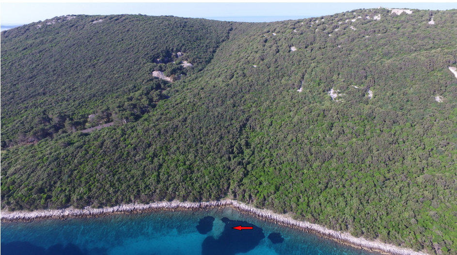
Fig. 3. Aerial view: quarry and the related harbor marked with arrow.

southerly direction. Recent interventions in the quarry only continued this movement towards the south while the use of the exit corridor continued.