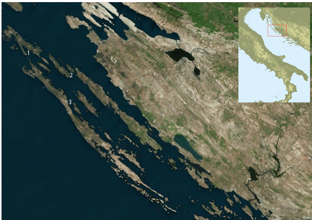
Fig. 1. Map of the Zadar archipelago with marked sites, 1- Molat, 2- Sestrunj, 3- Dugi Otok.

archipelago as the source of stone for building projects in Roman-period Zadar 14 . D. Magaš and R. Filipi discuss the great Roman-period quarries at Sestrunj island 15 . Z. Brusić has mapped the most significant quarries in the Zadar archipelago 16 .