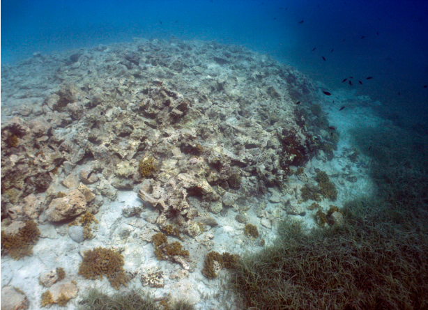
Fig. 11. Submerged stone bank-pier at Ovča Cove

of this particular quarry section. The layer stretches above the base rock and spoil is deposited above it.