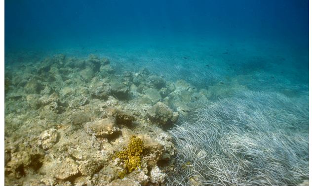
Fig. 8. Submerged part of the harbor construction