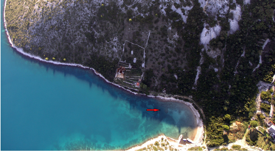
Fig. 9. Aerial photo: Ovča Cove