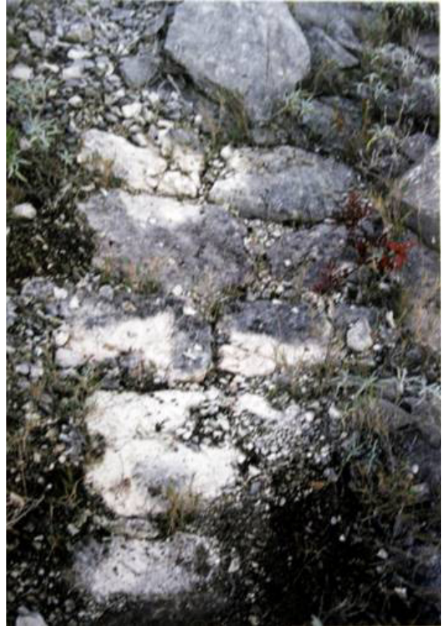
Fig. 12. Stone pavement at the lowering ramp

The second group of quarries is located in the Pa-drare area, about two kilometers south of Ovča Cove. The group consists of several quarries, including four larger and several smaller operations. Some of the larger quarries