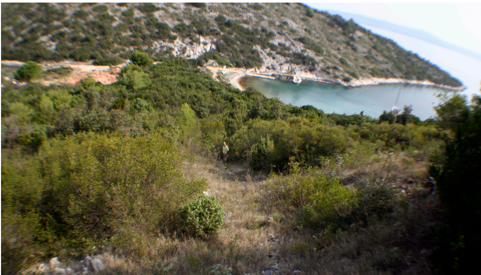
Fig. 10. Ramp for lowering stone blocks

opening. This feature is located at the point where the banks are nearly joined. The break in the construction is interpreted as a narrow entrance for ships, providing complete protection 27 . Larger ships for stone transport must have docked at the outer sides of these banks. The track between two parallel banks, in the direction of the profile A-B probably represents the remains of the original communication proceeding from the quarry (Fig. 7). This claim is supported by the fact that the terrain descends regularly and gradually at this section and also by the lack of base rock rising from the surrounding area.