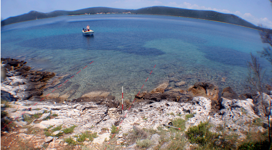
Fig. 4. The marked zone of refashioned bedrock, representing a road to the pier itself and used for loading stone blocks