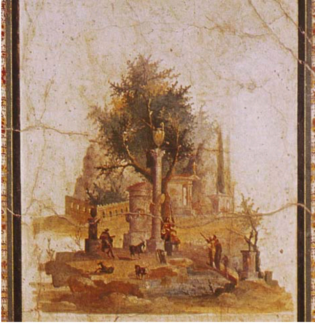
Fig. 4. Detail of columnar structures, red cubiculum (room 16), Villa of Agrippa Postumus at Boscotrecase, ca. 10 BCE. Museo Archeologico Nazionale di Napoli

unfinished temple to Olympian Zeus at Athens, it was to use them in his rebuilding of the Temple of Jupiter Optimus Maximus on the Capitoline, nominally in the same context, then. Materials originating from non-religious contexts would have been free from this restriction.