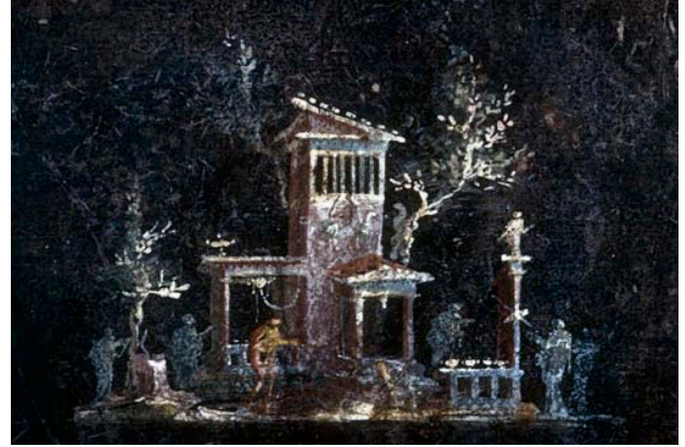
Fig. 5. Details of columnar structures, black cubiculum (room 15), Villa of Agrippa Postumus at Boscotrecase, ca. 10 BCE. Metropolitan Museum of Art

Columns also appear frequently in sacro-idyllic landscapes in Third Style wall painting, inspired by a Golden-Age peace and luxury and perhaps also by a reflection of real landscapes encountered in the Hellenistic east. Landscapes from the red and black rooms of the