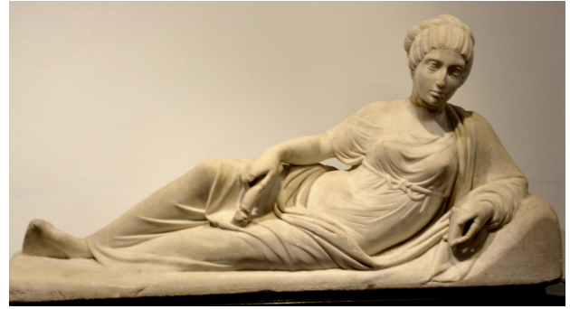
Fig. 7. Alexandria National Museum, reclining woman on a sarcophagus lid

Pan, made of a white transparent marble with medium and large crystals, either a white marble from Docimium or Parian marble (Fig. 3b); “Mars”, made of fine-grained marble, maybe Pentelic or white Docimium (Fig. 3a).