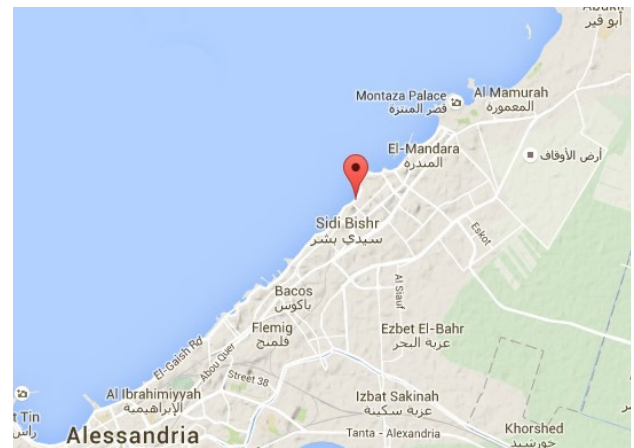
Fig. 1. Alexandria city map with an indication of the Mehamara area

The identification of the stones was based on examination of their macroscopic features, since archaeometric analyses were not permitted. This is also based on parallels with known marbles commonly employed at Alexandria. The identification of Proconnesian marble was possible through parallels with numerous groups of artefacts found at this city (statues, sarcophagi, and architectural elements). Recognition of other marble types is more hypothetical, being fundamentally based on historical patterns and parallels with sculptures kept in museums in Athens, Afyon and Aphrodisias. A significant parallel is represented by a small statuary group of Aphrodite and Pan in the museum at Afyon, showing similar features to the Aphrodite and Eros of Mehamara.