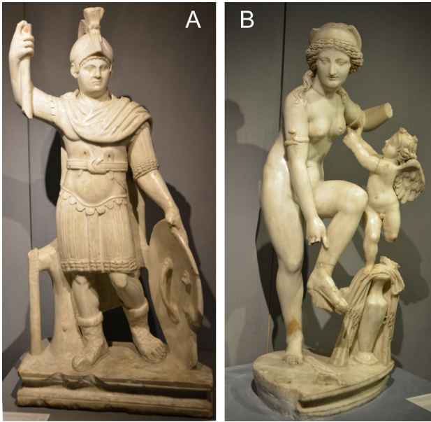
Fig. 3. Bibliotheca Alexandrina Antiquities Museum, A Mars; B Aphrodite and Eros

On the basis of both the subjects portrayed and their size, these eight sculptures can be divided into four groups: Aphrodite and Mars (Fig. 3); Dionysus and Harpocrates (Fig. 4); Asclepius and Hygeia (Fig. 5); Nilus and Euthenia (Fig. 6). This division was probably intended to reproduce a symmetrical setting, perhaps inside niches in an open space, in connection with fountains.