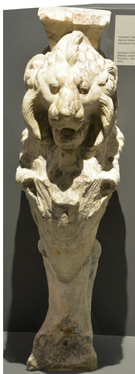
Fig. 8. Bibliotheca Alexandrina Antiquities Museum, table support