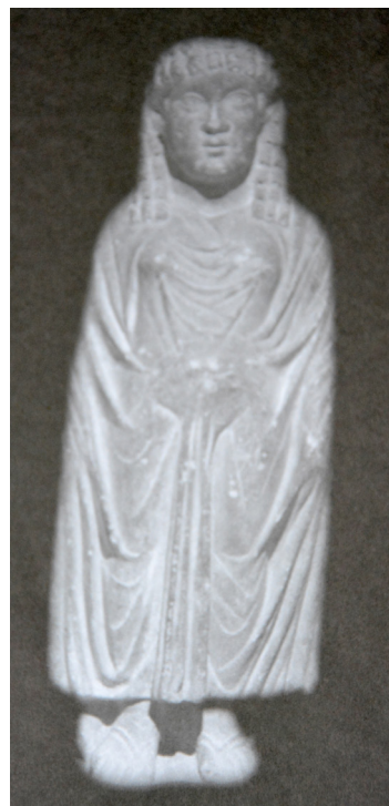
Fig. 9. Former Graeco- Roman Museum, Isis (SAVVOPOULOS, BIANCHI 2012, 161)

maybe belonging to the lararium of the domus 22 (Fig. 9).