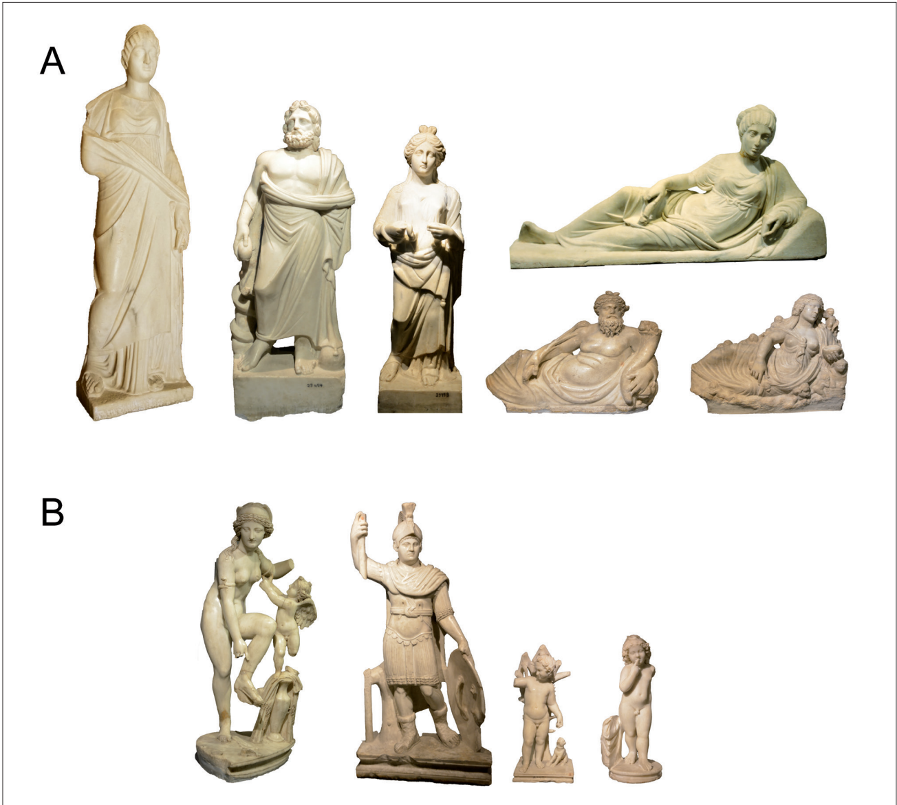
Fig. 10. Mehamara Collection, A Locally carved products from imports of Proconnesian blocks; B Locally finished products from imports of half-polished statues from several quarries

Aphrodisian sarcophagi found at several sites within the Egyptian metropolis, it is clear that these were roughed out at the quarry and finished once they reached their destination.