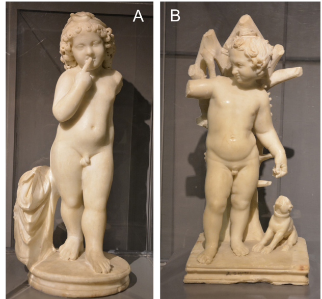
Fig. 4. Bibliotheca Alexandrina Antiquities Museum, A Harpocrates; B Infant Dionysus

showing facial features similar to those of the standing woman (Fig. 7). It can be attributed to a mausoleum that was included in the property, as testified by a passage of Strabo (17, 1, 16-17) mentioning that gardens of rich Alexandrians, often including family tombs, were present in this area.