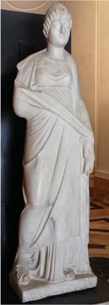
Fig. 2. Alexandria National Museum, standing female figure

It has been recently observed that this ensemble of statues was part of a collection composed of pieces with different chronologies, following a Late Antique fashion 5 . This phenomenon can be recognized inside villas, where it could be significantly widespread, as in the case of Chiragan in Aquitania 6 , but also in urban or suburban contexts, as in the Villa of Theseus at Nea Paphos in Cyprus 7 , and in a residence in the outskirts of Antiochia 8 . Some examples from Late Antique mid- and small-sized urban