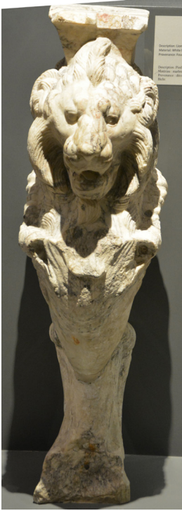
Fig. 8. Bibliotheca Alexandrina Antiquities Museum, table support