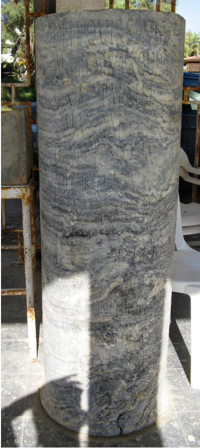
Fig. 2. Pedestal 1, showing inscription honoring Decimus Seius Seneca, in Sdot Yam Museum, July 2013