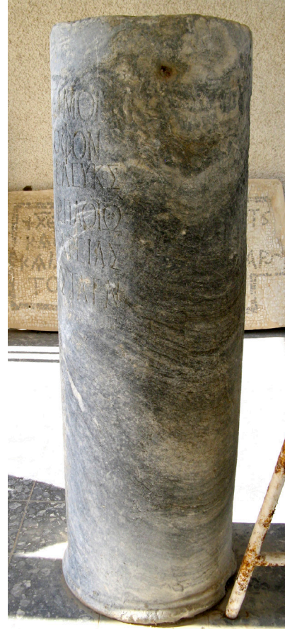
Fig. 3. Pedestal 2, showing inscription honoring Flavius Maximus, in Sdot Yam Museum, July 2013

above the inscription were probably for attachments to hold a new statue or its support in place. 8