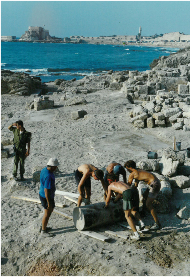
Fig. 4. Ehud Netzer (in white hat) supervising one of the inscribed pedestals being moved from its findspot in the Promontory Palace, August 1990

two junior members of the Tetrarchy, the Caesars Galerius and Constantius Chlorus, and this time both were dedicated by the same governor of the province, Aufidius Priscus. 9 Thus they were more likely part of a group, almost certainly including two other statues and pedestals, as the senior emperors Diocletian and Maximian would have had to be honored as well. These tetrarchic memorials must have been installed in the Praetorium between 293 and 305.