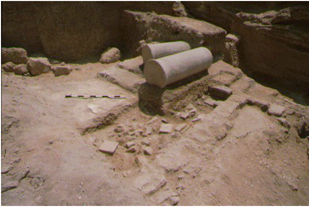
Fig. 1. Two marble pedestals as found in the Promontory Palace, Caesarea, August 1990

Extraordinarily, these pedestals were each used and inscribed at least five times, and the inscriptions can give us approximate dates for each reuse. Thus they themselves contain the documentation that may tell us when they were imported and how highly valued their dark grey banded marble seems to have been, despite the fact that words inscribed on this cippolino -like stone would have had to be brightly painted to be legible from any distance, as even modern photographs show that each pedestal's particular patterns and colors (Figs. 2, 3) almost completely obscure the lettering.