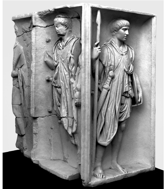
Fig. 6. Plaster Casts of the Joined Puteoli Panels in Philadelphia and in Berlin in the Museo dei Campi Flegrei, Baia

of the rightmost figure on the Penn panel is down, supporting a small oval shield ( palma ) at his left side (Fig. 5). This corner of the monument probably had a molded frame, but conservation of the panel carried out in 2009 shows that the present molding was reconstructed in the 19 th century (personal communication, Wolfgang Massmann, Antikensammlung conservation records, June 2013). In high relief in a frontal pose is a single soldier wearing a tunica , paenula , cingulum , and caligae , with a gladius hanging at his right side and a small oval shield, a palma , at his left. The viewers' right side of the panel is carefully finished, with a large ancient dowel cutting and pour channel from the top of the block and with 3 cm wide finely-picked contact bands at the front and back edges, all from the block's previous use. It is not clear, therefore, if another relief panel was attached at this edge. The back of this panel seems to have been sawed off in