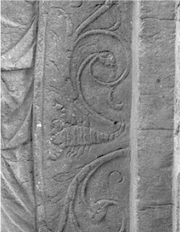
Fig. 3. Detail, Shield Emblem of Scorpion on Relief Panel, from Puteoli, University of Pennsylvania Museum of Archaeology and Anthropology, Philadelphia, MS 4916

a member or members of the Praetorian Guard, the elite protectors of the emperor, identified by their emblem, the scorpion, on the shield of one of the figures (Fig. 3). On the left edge of the panel is half of a figure in relief, marching to his right, wearing a short tunica , a paenula , and heavy sandals or caligae . He holds a spear in his left hand which leans against his left shoulder, passes by the back of the head of the figure behind him and ends at the top frame. We know that at least one more block would have been joined to the left side of this panel to complete this one figure.