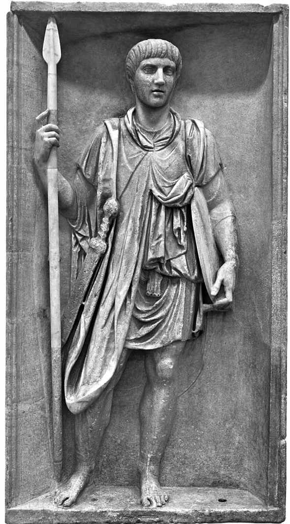
Fig. 4. Relief Panel, from Puteoli. Neues Museum, Antikensammlung, Staatliche Museen, Berlin, Sk 887, post-conservation, 2013

On the viewer's right is a figure in high relief, separated from the other two figures by a vertical molded frame. The background curves in deeply from the central