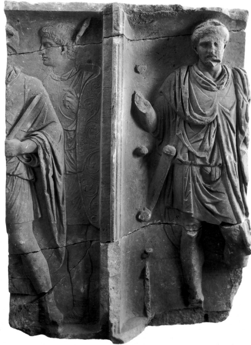
Fig. 2. Relief Panel with Roman Soldiers (Side B), from Puteoli. University of Pennsylvania Museum of Archaeology and Anthropology, Philadelphia, MS 4916

a notable exception, making it an especially important document for Roman history. The inscription was not destroyed but “erased,” using a chisel to carefully pick out the 11 lines, but it is still possible to read each line with a raking light. The inscription can be closely dated by historical information, including the death and so-called damnatio memoriae of Domitian, and by imperial titles, especially the reference to his 15 th tribunician year, to between September AD 95 and September AD 96.