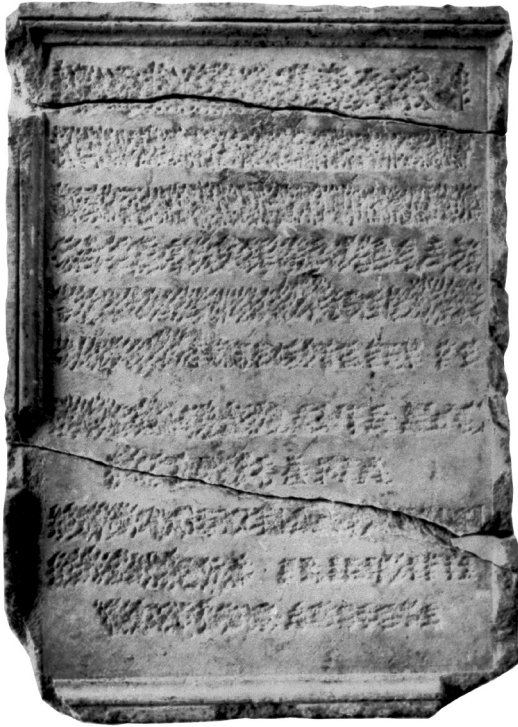
Fig. 1. Panel with Domitianic Inscription (Side A), from Puteoli. University of Pennsylvania Museum of Archaeology and Anthropology, Philadelphia, MS 4916