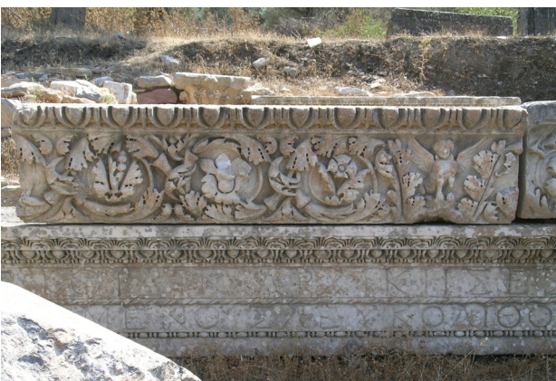
Fig. 4. Iasos (Turkey), Agora, eastern portico, frieze no. 6