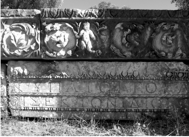
Fig. 15. Iasos (Turkey), Agora, eastern portico, frieze with peopled scrolls in white marble