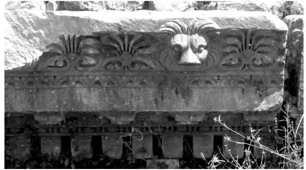
Fig. 5. Iasos (Turkey), Agora, northern portico, cornice no. 13