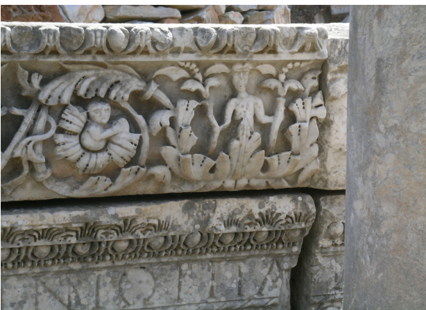
Fig. 3. Iasos (Turkey), Agora, eastern portico, frieze no. 5