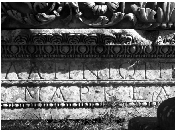
Fig. 14. Iasos (Turkey), Agora, eastern portico, architrave with inscription in white marble

and unquestionable. The same is true for the Euromos provenance of all stepped marbles (nos. 9-11). The marble of column no. 3 is characteristically brecciated and was assumed at first to be a variety of Euromos marble. But this is not the case. However, as shown clearly by the analyses, the exact provenance of this stone could not be determined, despite the fact that the data are compatible with a possible Ephesos 1 origin. The isotopic values and the weak EPR intensity of the floor slab confirm the macroscopic identification as Proconnesian marble. Proconnesian provenance is also suggested for the two cornices nos. 13 and 14, though these artifacts exhibit some atypical parameter values that make their provenance less obvious.