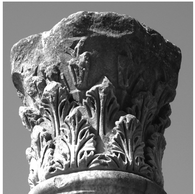
Fig. 11. Iasos (Turkey), Agora, eastern portico, Corinthian capital in white marble placed on the column shaft no.1

portico 15 . The provenance was obtained following a well established procedure that uses statistical data analysis of isotopic, EPR and grain size measurements to obtain the most probable quarry of provenance among a set of sources deemed to be viable on the basis of archaeological considerations and analytical properties. 16 The same procedure was adopted also for stepped marbles originating from Euromos despite the fact that this variety can be easily and unmistakably identified by eye and has no