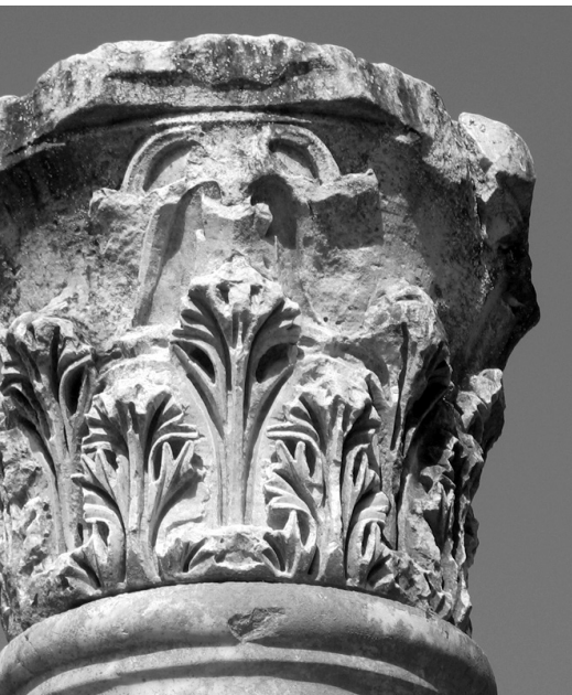
Fig. 10. Iasos (Turkey), Agora, eastern portico, Corinthian capital in white marble placed on the column shaft no. 2