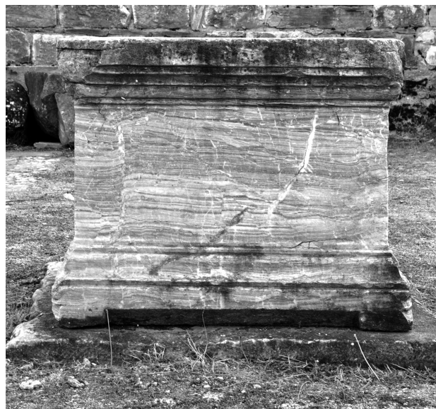
Fig. 8. Iasos (Turkey), Agora, southern portico, pedestal no. 11