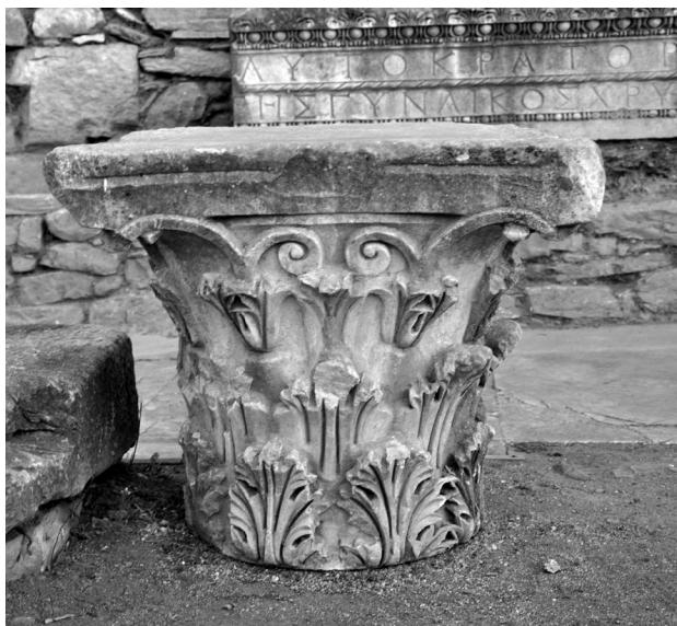
Fig. 7. Iasos (Turkey), Agora, eastern portico, Corinthian capital no. 8