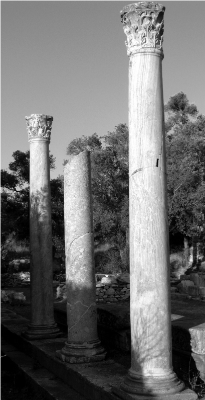
Fig. 2. Iasos (Turkey), Agora, eastern portico, column shafts (from left to right nos. 1, 3, 2)