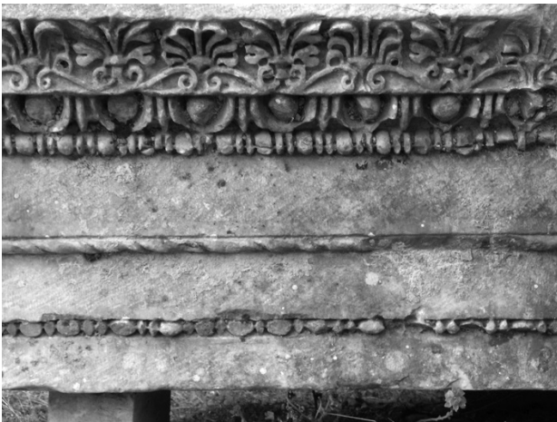
Fig. 13. Iasos (Turkey), Agora, northern portico, architrave in white marble