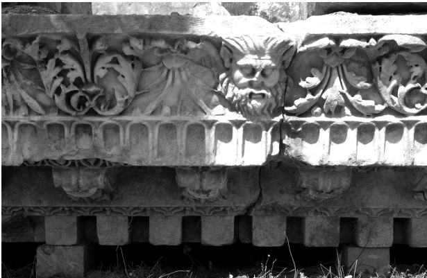
Fig. 16. Iasos (Turkey), Agora, northern portico, cornice in white marble. The anthemion is decorated with a Silenus head

The acanthus leaves are typologically identical to those of the Corinthian capitals; the flutes have a well shaped semi-circular upper edge.