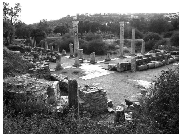
Fig. 1. Iasos (Turkey), general view of the Agora from the North-East corner

Iasos, a city on a rocky peninsula on the Gulf of Mandalya in Caria, underwent an intense building activity during the first centuries of imperial age. A new district was planned on the southern slopes of the hill and a new aqueduct was built while some of the public Hellenistic monuments were embellished, like the stage fronts of the theater and of the Bouleuterion, or completely reconstructed, like the porticoes of the central agora. In particular the reconstruction is perfectly dated between 136 and 138 AD by the inscription written on the architrave. 1