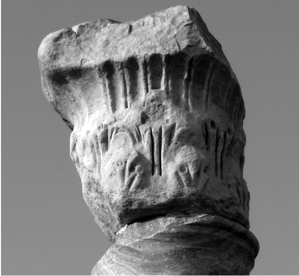
Fig. 12. Iasos (Turkey), Agora, northern portico, Corinthian capital in white marble placed on the column shaft at the North-East corner