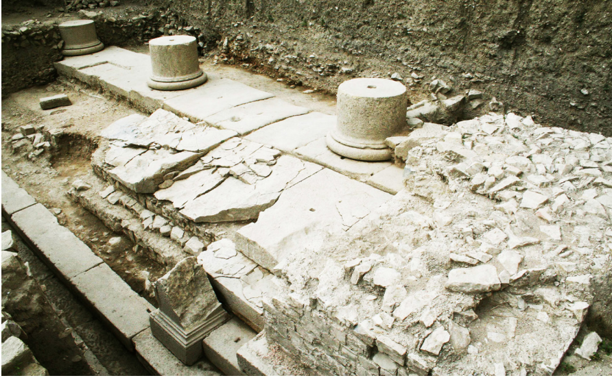
Fig. 1. Vaison-la-Romaine, Forum, stylobate and columns on the portico carved in local limestone

The quarries were situated near the city – one west of it, the Théos hill (colline de Théos), three in the south-west – Les Roussillons, Ravin de Mars, Sainte-Catherine, and one east of Vaison – by the road to Malaucène. These quarries were exploited until the 19 th century; nevertheless, due to the layer thickness (15-20 cm), they provided only small blocks. For the bigger dimension stones, a shelly limestone was imported from the quarries situated at Beaumont-du-Ventoux. These quarries, exploited until the 1950s, contained a Burdigalian limestone deposit.