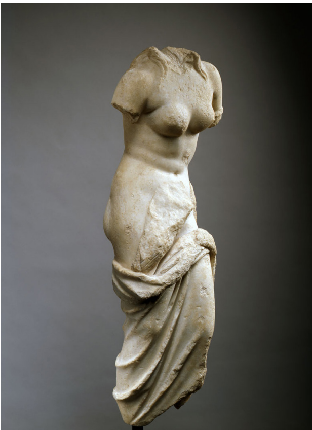
Fig. 3. Statue of Leda and the Swan