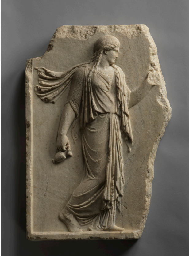
Fig. 2. Relief of a draped woman