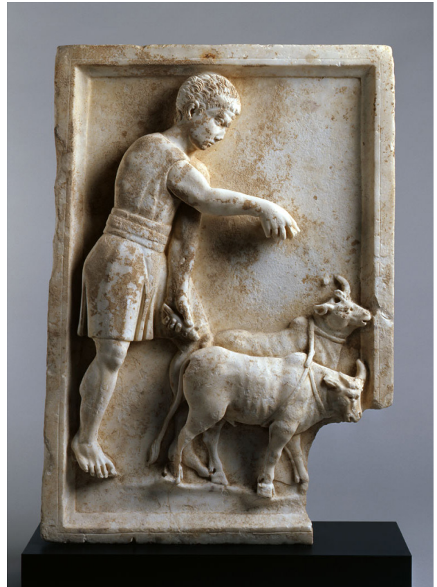
Fig. 5. Relief of a ploughman