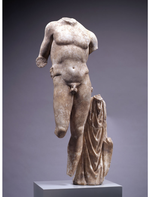
Fig. 4. Statue of Apollo of Anzio type