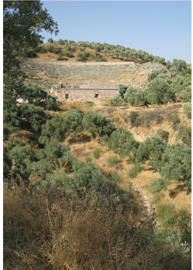
Fig. 2. View of the theatre from the South

As the geological settings indicate, Nysa had marble sources in its proximity. An ancient quarry district was identified ca. 2 km west of the city near the modern village of Eskihisar 7 . Tool traces on the quarry faces and remains of the quarry output – e.g. blocks and large-size column drums – clearly testify to ancient extraction of construction material (Fig. 1). Both macroscopic observations and chemical investigation indicate that the local quarry of Nysa provided two varieties of medium-grained marble of different colour: white and a blue-grey, respectively. Both marble varieties show