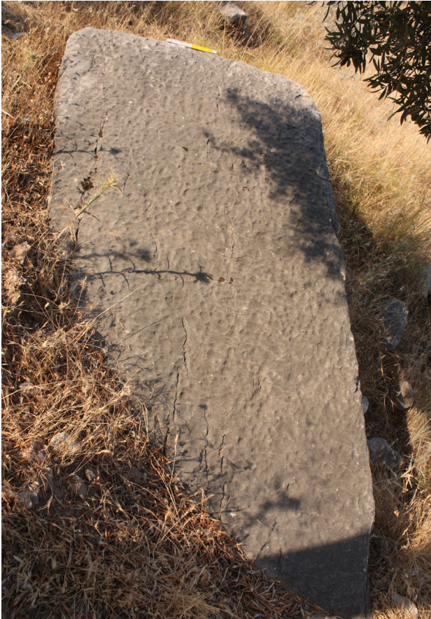
Fig. 1. Local quarry of Nysa. Abandoned block at the quarry

– abounded in marble sources that were consequently used as construction material for the local urban adornment. The high incidence of marble sources was determined by the geology of these regions whose boundaries nearly coincided with the geologic unit of the Menderes-Massif and also included a part of the Attic-Cycladic-formation 6 .