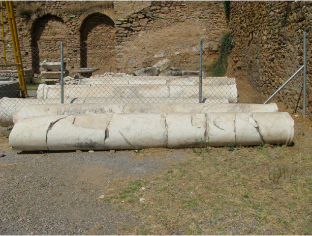
Fig. 7. Column shafts of the 1 st storey of the scaenae frons