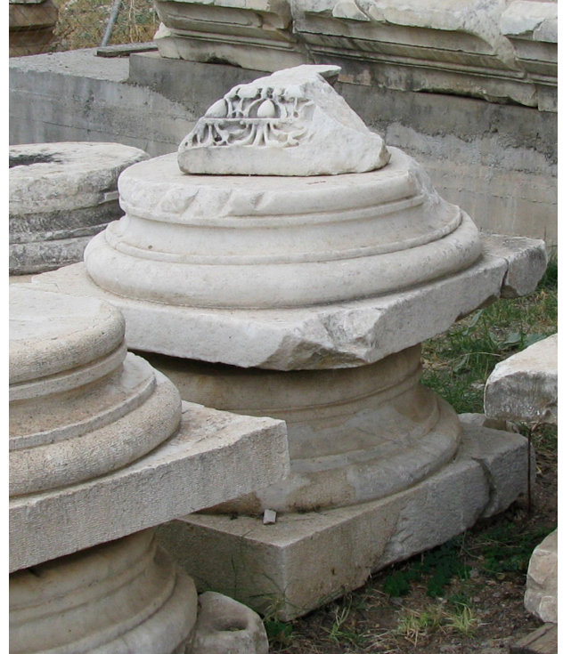
Fig. 6. Reused cornice (see the denticules on the upper torus carved to a basis of the 1 st storey of the scaenae frons )

The marble of the theatre seats is white-grey coloured whereas the material of the analemma -walls includes in addition to this white-grey marble, also a grey-bluish variety (Fig. 3). These petrographic features (colour, grain size, patina) suggest the local origin of the marble; the EPR and isotopic analysis conducted on samples from two analemma -blocks demonstrate that this marble was quarried locally (see below, Table 1 and 2). White-grey and grey-bluish marble blocks of small, irregular form are also used for the opus-mixtum and opus incertum -facing of the proskenion and of the building stage 14 . It can be inferred that the bulk of the marble used for the construction of the theatre was of local origin and that the local quarries were still exploited in the Imperial time.