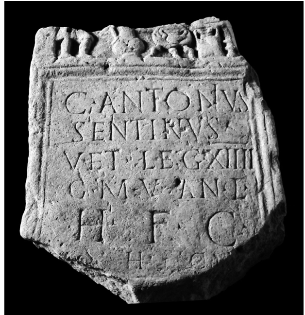
Fig. 4. Funerary stela from Sisak, Gradski muzej Sisak

hand, the motif of the reduced meal is very often depicted on Pannonian funerary stelae, but never as the main scene; it is always submitted to or even merged with the portrait of the deceased (cf. Lupa 691, 2750, 2756, etc.). On balance, the stela from Aljmaš was of the type designed in Norican marble workshops, but it was decorated in a way different from Norico-Pannonian marble pieces of the same type, as well as from north-Pannonian travertine stelae. Therefore, the stone material of the stela from Aljmaš proves its north-Pannonian origin, suggesting at the same time that stone monuments travelled from Aquincum to Mursa as half-products, to be decorated according to individual tastes, manifestly different from those typical of other Pannonian and Norican stonemasonry workshops.