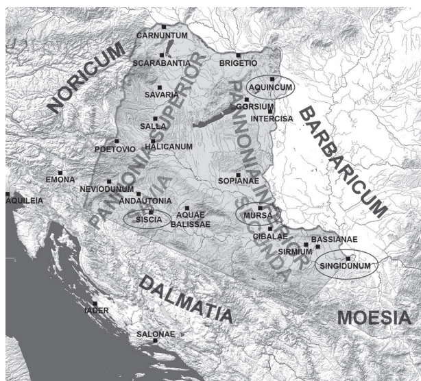
Fig. 2. Map of Pannonia (readjusted after MIGOTTI 2012, p. 2)

that this piece was imported and can be considered as the western-most travertine example in the south-Pannonian territory, it remains to wonder about the economic rationale behind such commerce. 7 The question to be asked is why anyone would want to import a limestone piece from a large distance, and iconographically quite unassuming at that, when there was enough quality limestone closer to the place of purchase. Was river transport really that cheap, or was it an individual undertaking, making use of some unknown opportunity? As for the river transport, the piece intended for Siscia either needed to be transported from Mursa to Siscia without a direct water route, that is, by using a land transport between the Drava and Sava Rivers, or it needed to be taken all the way to Singidunum in Moesia Superior via the Danube, and then via the Sava to Siscia (Fig. 2). In the latter case, we should probably reckon with additional provincial customs duties. 8 In any case, the commercial logic behind this purchase remains obscure.