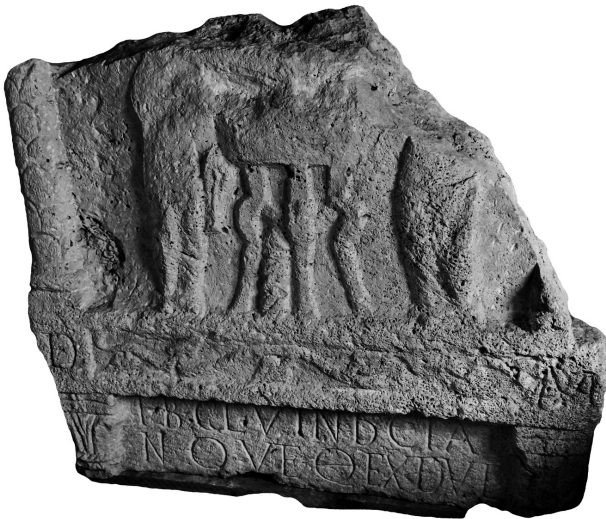
Fig. 3. Funerary stela from Aljmaš, AMZ (Lupa 4308)