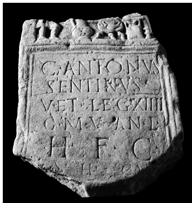
Fig. 4. Funerary stela from Sisak, Gradski muzej Sisak

hand, the motif of the reduced meal is very often depicted on Pannonian funerary stelae, but never as the main scene; it is always submitted to or even merged with the portrait of the deceased (cf. Lupa 691, 2750, 2756, etc.). On balance, the stela from Aljmaš was of the type designed in Norican marble workshops, but it was decorated in a way different from Norico-Pannonian marble pieces of the same type, as well as from north-Pannonian travertine stelae. Therefore, the stone material of the stela from Aljmaš proves its north-Pannonian origin, suggesting at the same time that stone monuments travelled from Aquincum to Mursa as half-products, to be decorated according to individual tastes, manifestly different from those typical of other Pannonian and Norican stonemasonry workshops.