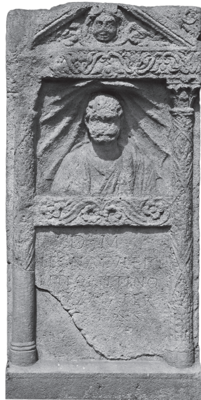
Fig. 7. Stela from Sisak AMZ