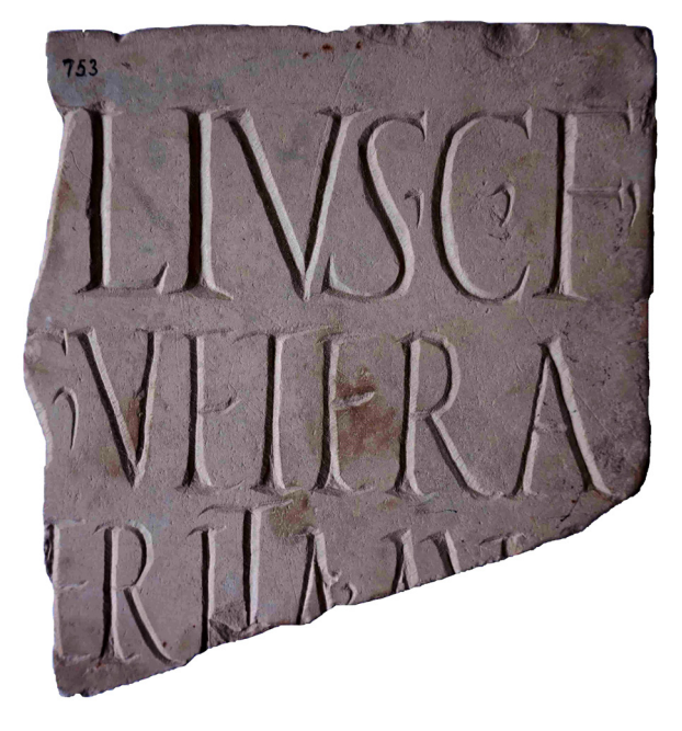
Fig. 4. Inscriptions of private persons: a freedman (CIL II2/14, 1487) and a freeborn man (CIL II2/14, 1080)

remain to be checked, but these slabs are very fragmentary with just one or two letters. The main result is an updated catalogue that doubles the number of total entries.