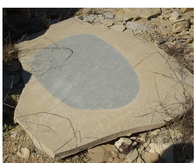
Fig. 3. Alcover stone slabs in different colours: A: beige red (due to fire) (CIL II2/14, 977), B: beige (CIL II2/14, 1270) and C: a case of combination of two tones in the same slab