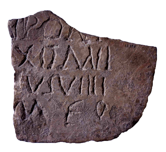
Fig. 7. Slab with an epitaph from the 4^{th} - 5^{th} centuries (CIL II2/14, 1603)

parallelepiped blocks, a kind of support that previously only stones similar to El Mèdol were capable of providing. As previously noted, archaeology does not offer evidence of when the Alcover quarries were abandoned, but one can have some confidence that their stone was gradually replaced by Santa Tecla and other minor local limestones - among them the so-called "llisós"- until its total disappearance from the epigraphic record.<sup>22</sup>