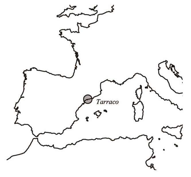
Fig. 1. Tarraco in the western Mediterranean context

Updating of the recently re-edited epigraphic corpus<sup>1</sup> is a key element in a multidisciplinary project aiming at understanding the stones used for the inscriptions of Tarraco (Hispania Tarraconensis). <sup>2</sup> After a study of Santa Tecla