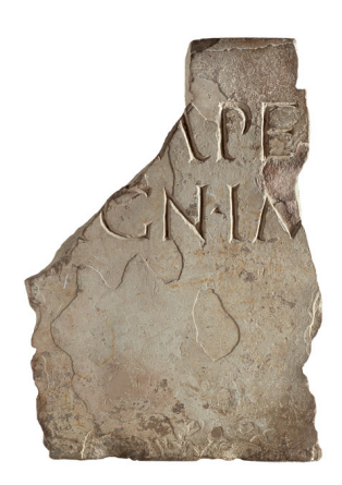
Fig. 6. Opistographic inscription from Tarraco (CIL II2/14, 991-988)

Augustan age. This type of Mèdol epitaph characterizes the Republican epigraphy of Tarraco and disappears in the first decades of the 1^{\rm st} century AD. ^{18}