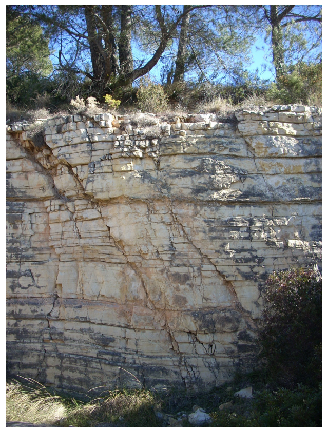
Fig. 2. Two examples of the strong bedding of Alcover stone outcrops. A: millimetric/centimetric and B: decimetric bedding

the quarries have demonstrated the Roman presence at least during the 1<sup>st</sup>-2<sup>nd</sup> centuries AD.<sup>5</sup>