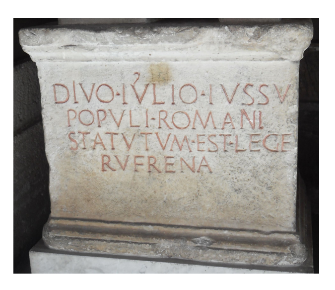
Fig. 5. Inscription of Divus Iulius from Otriculum (CIL VI, 872 = CIL I, 797)

society and wealthy private individuals preferred local Alcover stone for public as well as private inscriptions.