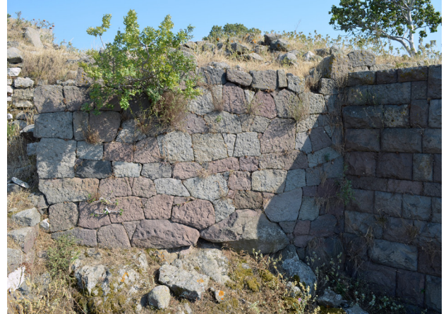
Fig. 9. Coursed polygonal masonry that includes multicolored andesite blocks near tower VII on the acropolis

with the use of four-five edged reddish-brown and bluish-grey andesite blocks together.