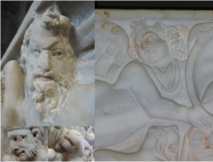
Fig. 8. The polychrome details show that bright pink is ordinarily used to paint the inner parts of mouth, nostrils, lachrymal ducts (and blood that comes out of the wounds) on Roman marble sarcophagi from the early 2 nd century to the late 4 th century AD; this correspond with a documented 'pictorial paradigm'