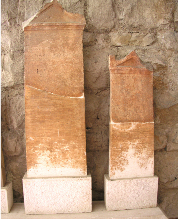
Fig 2. Simple types of Hellenistic stelai from the island of Issa

However, the purpose of this paper is not to shed a measure of light on Greek, but rather on Roman stonemasonry, and the latter only within the context of the production of funerary monuments, which was one of the most developed trades alongside construction, particularly in the middle Dalmatia and Salona, the center of the Roman province of Dalmatia (Fig. 1). The Romans made use of the stone to a much larger degree than the Greeks, which is to be expected, considering the small number and size of the Greek settlements. Thus the Roman settlements were much larger, and the local, pre-Roman population was already romanized, which is to say, had adapted to the Roman way of life. Towns developed because the local people tended to gravitate towards them, along with people from other corners of the antique world, as numerous inscriptions clearly indicate. Thus there was a large increase in the number of citizens living in cities, which meant that there was suddenly a great need for stone as a construction material in some of the most populous cities, specifically for the manufacture of decorations, all kinds of sculptures, and funeral monuments in particular, which led to the expansion of old quarries and the opening of new ones.