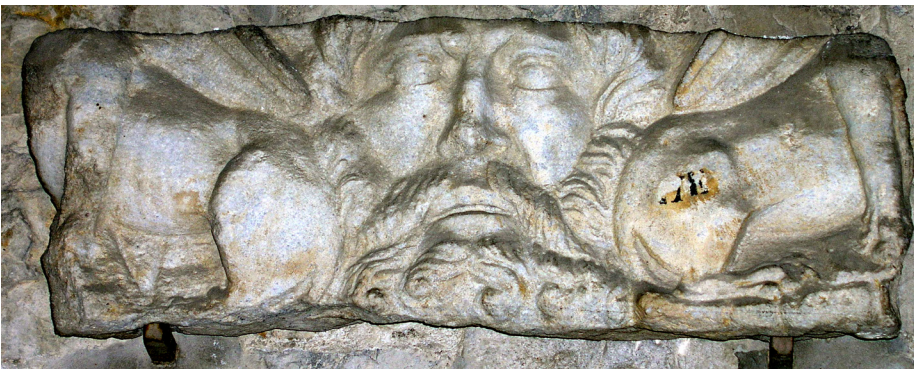
Fig. 15. Sarcophagus fragment of Carrara marble (Salona)

mythological themes, were imported from the aforementioned stoneworking centers. 14 Even though their numbers were far more limited, sarcophagi made from Carrara marble manufactured in the workshops of Rome were also represented in Dalmatia, and mostly in Salona (Fig. 15). 15 Sarcophagi from Proconnesian marble were predominantly brought to Dalmatia as roughly hewn blocks, which were then finished on the spot. 16