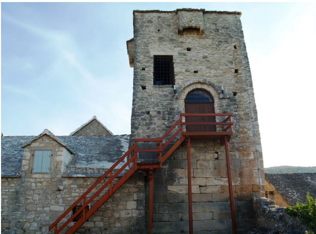
Fig. 21. The Škrip watch tower

Not even Škrip, or anywhere else on Brač, saw the development of a civilian city. Škrip is the only place to display any of the characteristics of a city at the time; walls, streets, a forum, and temples, but no inscriptions to indicate a civil constitution (Fig. 19). Unlike Trogir, which became an archdiocese and city in the Middle Ages, Škrip never developed to that point. Thus, Brač was the only large island on the eastern Adriatic without its own city center. Any attempts to (falsely) corroborate the existence of a city here in the Middle Ages are entirely baseless. 33 The Roman imperial administration actively blocked any civil development. It was only under modern administrative structures that Supetar became