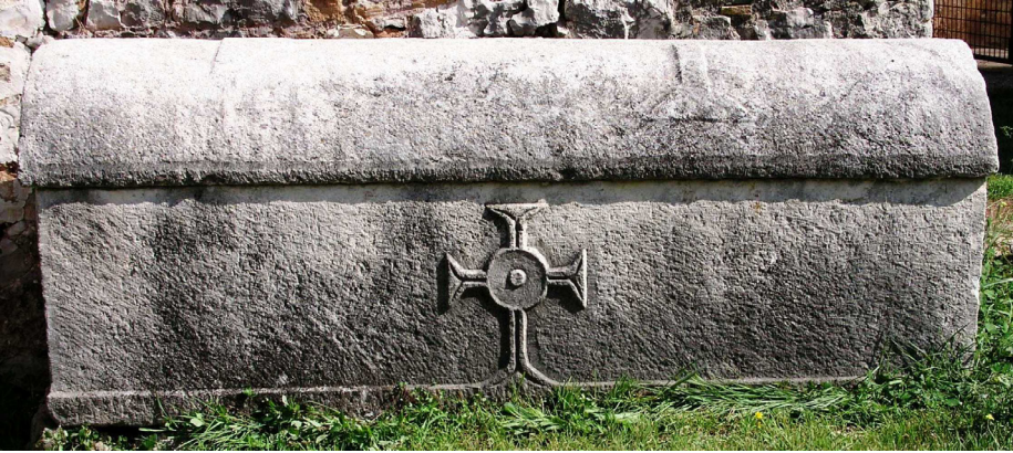
Fig. 12. Local sarcophagus with cross