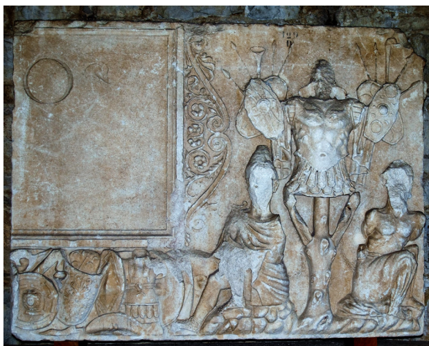
Fig. 7. Roman military tropaeum from Gardun

on their own 9 . Accompanying the soldiers that served in Dalmatia, who were stationed in legion camps (Burnum and Tilurium) at the start of the 1 st century, came monumental and richly decorated monuments, which often featured military symbolism and tools (Fig. 6).