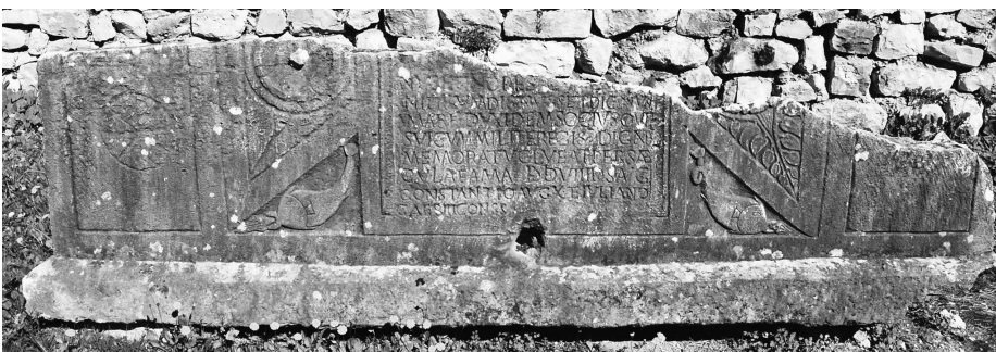
Fig. 11. Fragment of Christian sarcophagus chest

convenient for Christian burials, as they were suited to laying whole bodies to rest, as well as housing numerous bodies (Fig. 11). We have uncovered over 2000 sarcophagi and fragments to date, but this number is provisional, as there are new discoveries appearing every day.