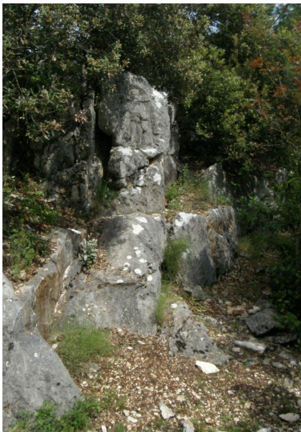
Fig. 16. Hercules' shrine in the Rasohe quarry on the island of Brač