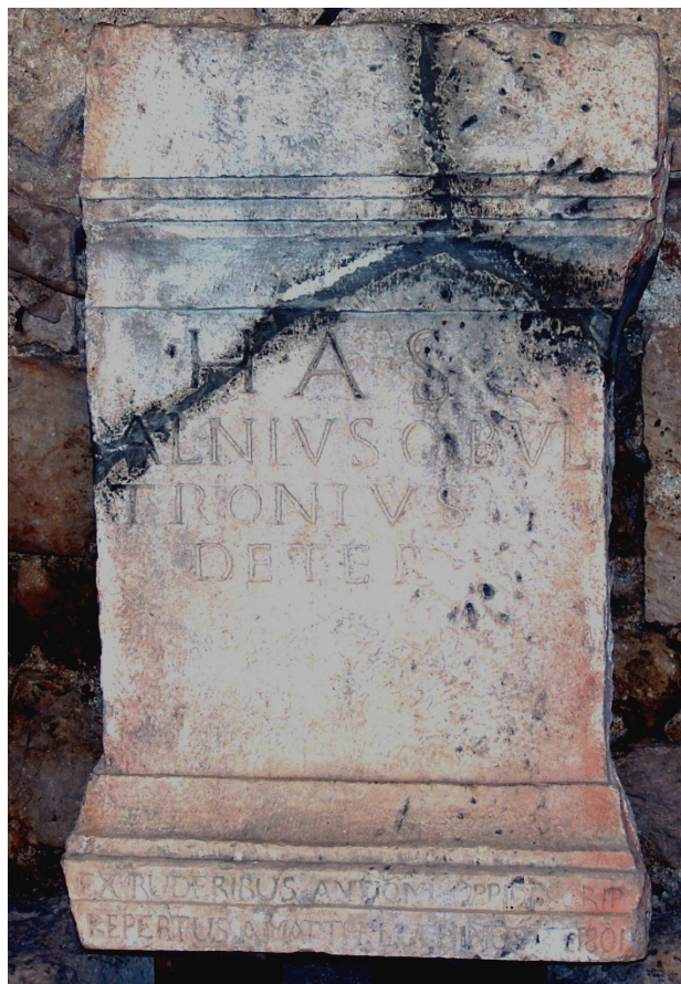
Fig. 17. Altar dedicated to Hercules

they founded the settlement. 17 Pliny the Elder, in his well-known characterization of the settlement: Tragurium civium Romanorum marmore notum , thus giving two definitions of the city. On one hand, it is a town of Roman citizens known for its marble (limestone). 18 Tragurium, like its mother town of Issa, went on to become a town of citizens who had Roman citizenships in the later period of the Republic, even though it still had not acquired the status of a city. 19 The municipal status was undoubtedly lost for Tragurium when Issa allied with the losing side in the war between Caesar and Pompey, which was largely fought on the eastern coast of the Adriatic. It is likely that the exploitation of the quarries passed into the ownership of the emperor as early as the age of Augustus. The history of the quarries is told through inscriptions dedicated