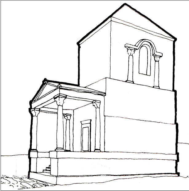
Fig. 20. The Škrip tower. The island of Brač (reconstruction by S. Faber)