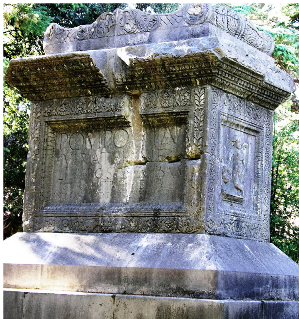
Fig. 8. Ara of Pomponia Vera from Salona

During the 1 st century, the repertoires of the workshops that produced these funerary monuments were broadened with the addition of other funeral monuments, with the most numerous among them originating from cult sacrificial altars. The leap from altar to funeral monument of a similar shape is not that great, as the grave were locus religiosus , upon which sacrifices were offered for the deceased, or more specifically, for the gods of the underworld, which led to the introduction of the inscription D(is) M(anibus) at the end of the 1 st century (Fig. 8).