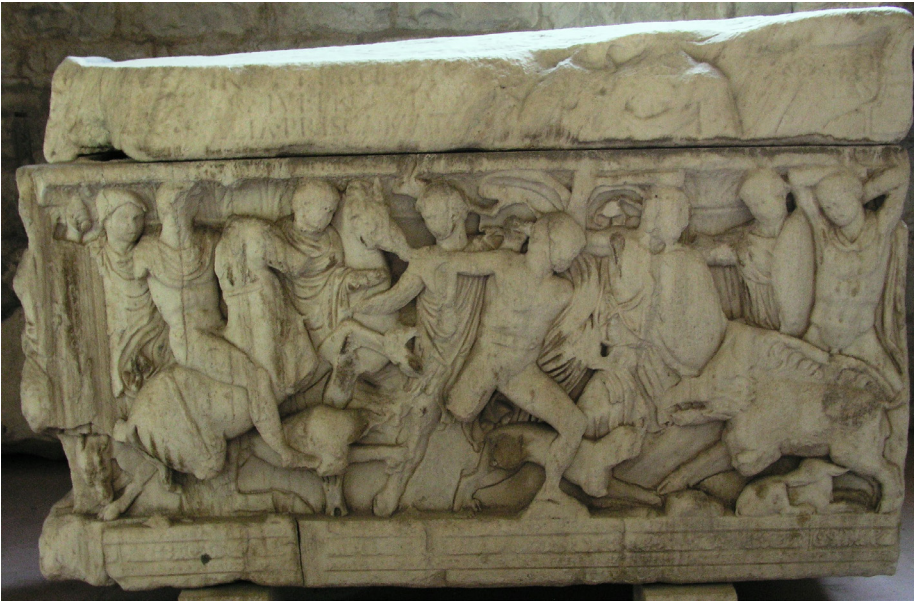
Fig. 14. An Attic sarcophagus. Split