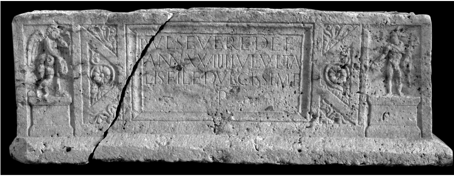
Fig. 9. An example of local Salonitan sarcophagus. Vranjic near Salona