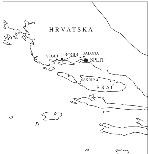
Fig. 1. Map of Central Dalmatia showing the locations of stone quarries

stone, stone quarries, sepulchral monuments, Dalmatia