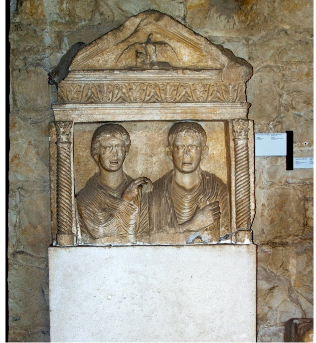
Fig. 5. Luxury Roman stela from Salona

consumers. The complexity and simplicity of their forms and decorations clearly gravitated toward the latter in the larger center of production in Issa. However, the manufacture of a smaller number of more complex types points to the workshops' ability to adopt more elaborated forms of monument. As far as the epigraphy is concerned, there is a clear trend toward simplicity, mostly without complex sentences, with predominantly larger sets of names appearing, as the tombs of Issa were often used to bury several generations of a given family. They would usually all appear listed on one funerary monument. 2 It was not possible to determine whether there were multiple funeral monuments under one grave chamber, known to house up to several dozen skeletons. 3 This would have been a logical conclusion, as there was a general desire for posthumous individualization.