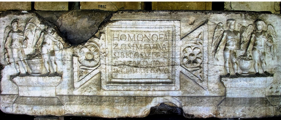
Fig. 13. A sarcophagus chest of Proconnesian marble Salona

and simple cover with four acroteria or cylindrical lid (Fig. 12). They featured several types of crosses. 11