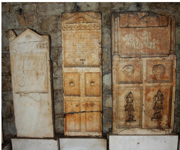
Fig. 6. Examples of Roman military stelae from Gardun