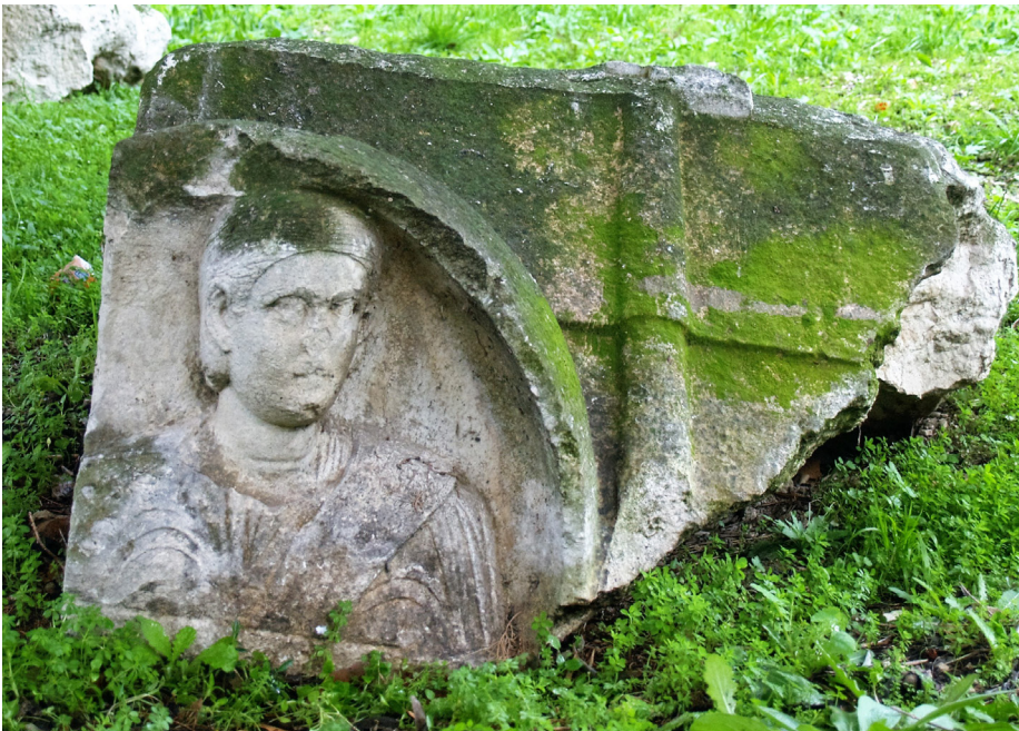
Fig. 10. A fragment of sarcophagus lid from Salona. Early 3 rd century