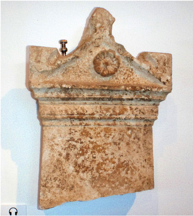
Fig. 4. Stele of Hellenistic type from Narona