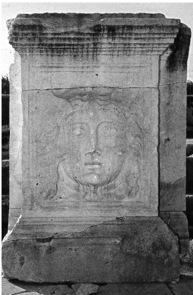
Fig. 9. Aquileia (Udine, Italy). Plinth in Aurisina limestone decorated with the head of Medusa from the forum

the Po and its tributaries. Thus, it could reach some cities of Regio XI situated at a distance of about 400 km from the quarries, like Milano and Pavia. Probably in the same way, the stone reached also some cities of Regio VIII , like Modena and Reggio Emilia. By sea, Aurisina limestone also reached some more distant cities situated along the Adriatic coasts, like Ravenna, Rimini and Fano.