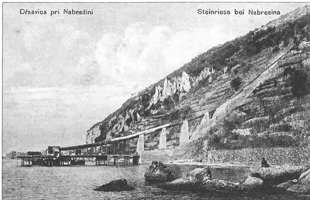
Fig. 6. A slide used at the beginning of the 20 th century to move stone chips and blocks from the quarries to the sea (from: FLEGO, RUPEL, ZUPANČIČ 2001)