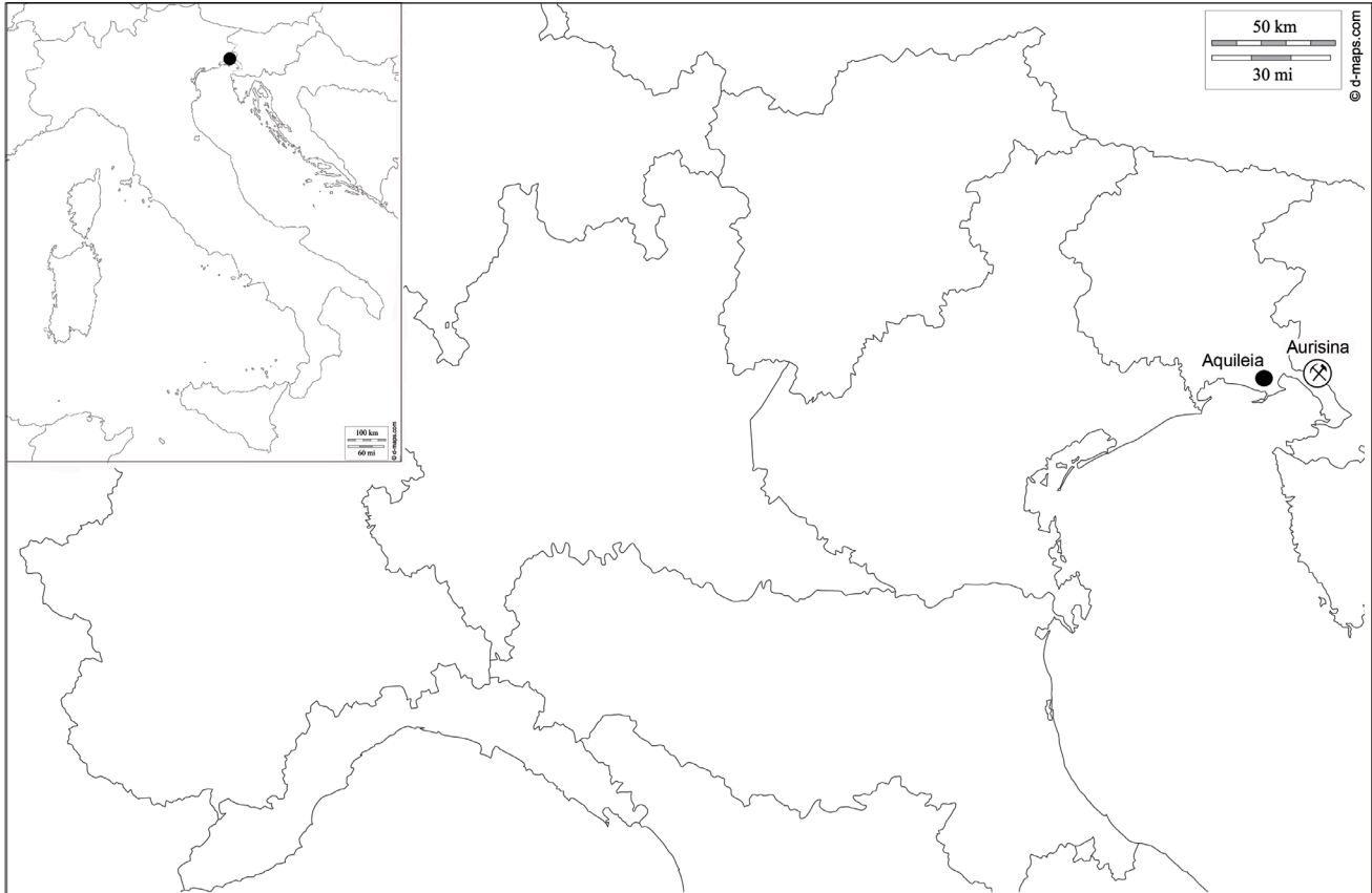
Fig. 1. Map showing the position of the Aurisina quarries (north-eastern Italy), which in the Roman Age were situated in territory belonging to the city of Aquileia