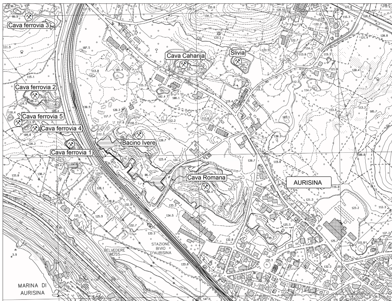
Fig. 3. Map of the quarries situated in the Aurisina extraction basin which have been identified and surveyed (base map CTR 1:5000 n. 109042, Sistiana)

The Aurisina quarries were exploited for a long period, at least until the beginning of the 6 th century, when the great monolith covering the Mausoleum of Teodorico in Ravenna, which is made of Aurisina limestone, was extracted 7 .