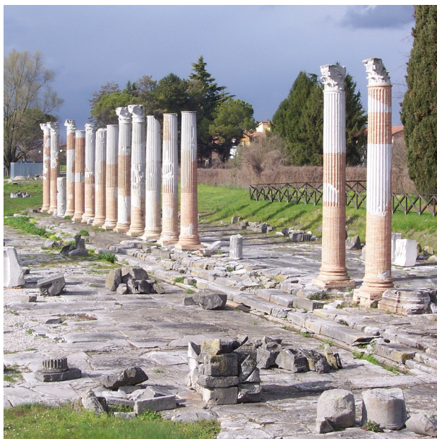
Fig. 8. Aquileia (Udine, Italy). The forum of the colony, entirely constructed in Aurisina limestone. For the square's paving 1500 m 3 of limestone was used