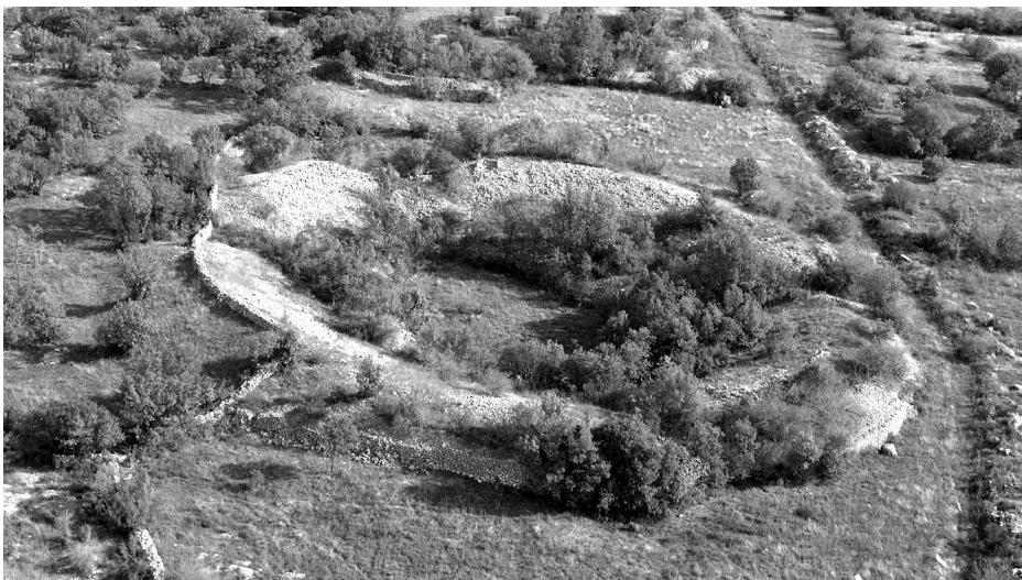
Fig. 2. Aerial photograph of Burnum amphitheatre prior to archaeological works

Archaeology of the University of Zadar and the Municipal Museum of Drniš in cooperation with Laboratorio di Rilievo delle Strutture Archeologiche del Dipartimento di Archeologia dell'Università di Bologna supported by Krka National Park (e.g. CAMBI et al. 2006; CAMBI et al. 2007; CAMBI et al. 2008, 397-408; GLAVIČIĆ, MILETIĆ 2009, 75-84; GLAVIČIĆ 2011, 289-313; GLAVIČIĆ, MILETIĆ 2013, 157-172). The research revealed the construction of an amphitheatre ( amphitheatrum ) and some other military structures on the northwest margin of the Roman military camp (Fig. 1). It was also determined that the karst area was levelled, small depressions being filled by material consisting of small scale archaeological remains such as military equipment, arms fragments and everyday items. About the whole expanse of the amphitheatre was explored in detail. Constructional solutions that were adopted for the integration of objects within the natural