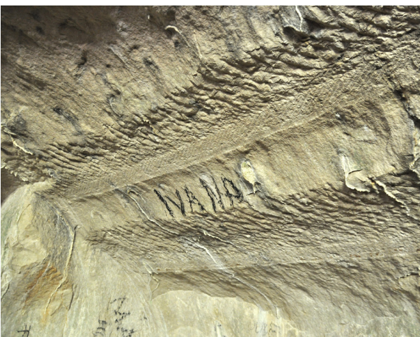
Fig. 6. Tool marks in the ancient quarry on Sutvara, state today