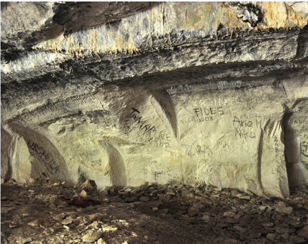
Fig. 5. Ancient quarry on the island of Sutvara, state today