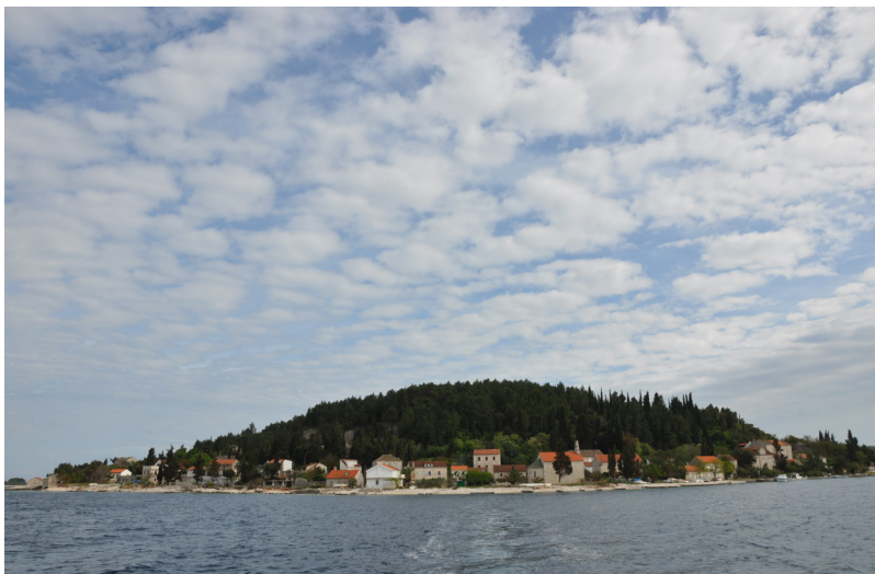
Fig. 3. Island of Vrnik