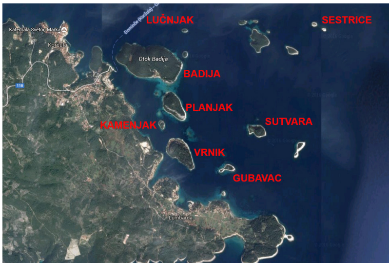
Fig. 2. View of the eastern part of the island of Korčula with places from which stone was excavated marked