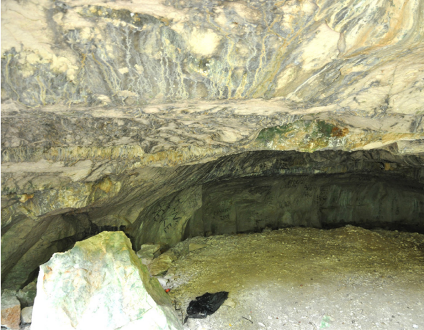
Fig. 4. Ancient quarry on the island of Sutvara, state today (photo: I. Lipanović, 2014.)